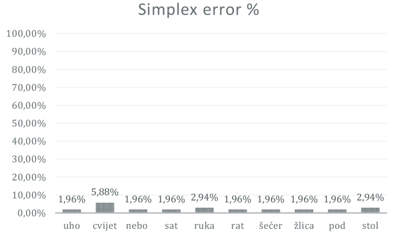
Figure 1. Task 3 – Error rates for individual unmotivated words. As the percentiles show, speakers have a very low error rate when it comes to simplex words inaccurately being identified as motivated.

Answers in Tasks 2, 3 and 4 were coded for accuracy, and a chi-square test 2x2 table (with Yates correction) was used. The results show a correlation between MT transparency and accuracy in identifying suffixes (Task 4), as well as distinguishing between derived and simplex words (Task 3). In Task 4 suffixes were more accurately identified in MT transparent than MT non-transparent words ( \chi^2 = 234.48 , df = 1, p < .01), and in Task 3 MT transparent words were more accurately identified as motivated (derived) than MT non-transparent words ( \chi^2 = 166.35 , df = 1, p < .01). In Task 3 the overall error rate for identifying unmotivated (simplex) words as motivated was very low (2.55%), which is also evident from the error rates for individual unmotivated words in Figure 1.