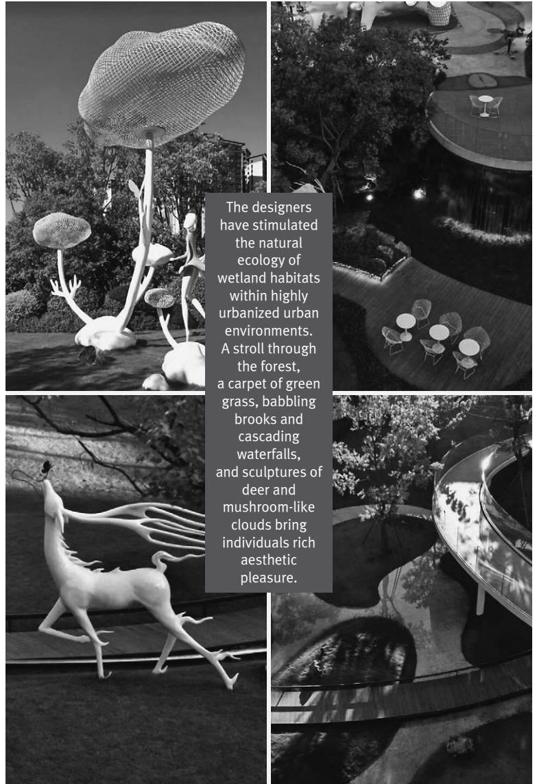
FIG. 1 THE COMBINATION OF NATURAL ECOLOGY AND URBAN LIFE WITHIN THE FRAMEWORK OF URBAN FOREST