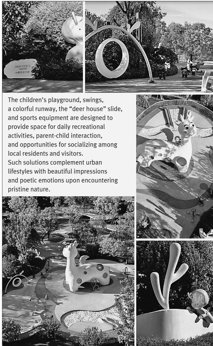
FIG. 2 THE CHILDREN'S UNIT OF THE PROJECT THE CITY GATHER PARK

The children's playground, swings, a colorful runway, the "deer house" slide, and sports equipment are designed to provide space for daily recreational activities, parent-child interaction, and opportunities for socializing among local residents and visitors. Such solutions complement urban lifestyles with beautiful impressions and poetic emotions upon encountering pristine nature.