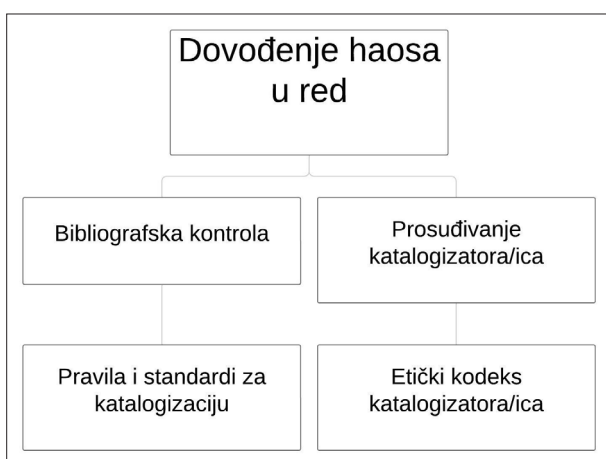
Slika 1. Dijagram načina dovođenja haosa u red s dokumentima kojih ih reguliraju, odnosno trebaju regulirati

katalogizatora/ica nije da diktira rješenja za svaki specifičan etički problem (Shoemaker, 2015), već da katalogizatoru/ici pri njegovom/njenom slobodnom prosuđivanju posluži kao alat na osnovu kojeg će na najbolji način moći odgovoriti na svaku nastalu situaciju. Stoga i funkcija kodeksa mora biti trojaka: 1) davanje smjernica za etično djelovanje, zatim 2) kodeks u obliku konkretnog dokumenta imao bi veći legitimitet ako bi iza njega stajala stručna organizacija, odnosno udruženje, kao i radi 3) opravdavanja odluka pretpostavljenim i administraciji unutar matičnih ustanova (Shoemaker, 2015). Isto tako, ako je proces dovođenja haosa u red, koji se postiže putem bibliografske kontrole, regulisan standardima i pravilima, onda i onaj do kojeg se dolazi slobodnim prosuđivanjem katalogizatora/ice, kao prostor u katalogiziranju gdje se etika primjenjuje (Fox i Reece, 2012), treba na neki način biti regulisan, odnosno oblikovan određenim dokumentom. Taj dokument također treba podržati stručna organizacija, kako bi njime, posljedično, katalogizatori/ce mogli opravdavati svoje odluke pri katalogiziranju. Postupak dovođenja haosa u red kroz bibliografsku kontrolu i prosuđivanjem katalogizatora/ica koji je opisala A. M. Ferris tako bi mogao biti proširen i predstavljen kroz dokumente koji tu oblast reguliraju, kao u sljedećem dijagramu: