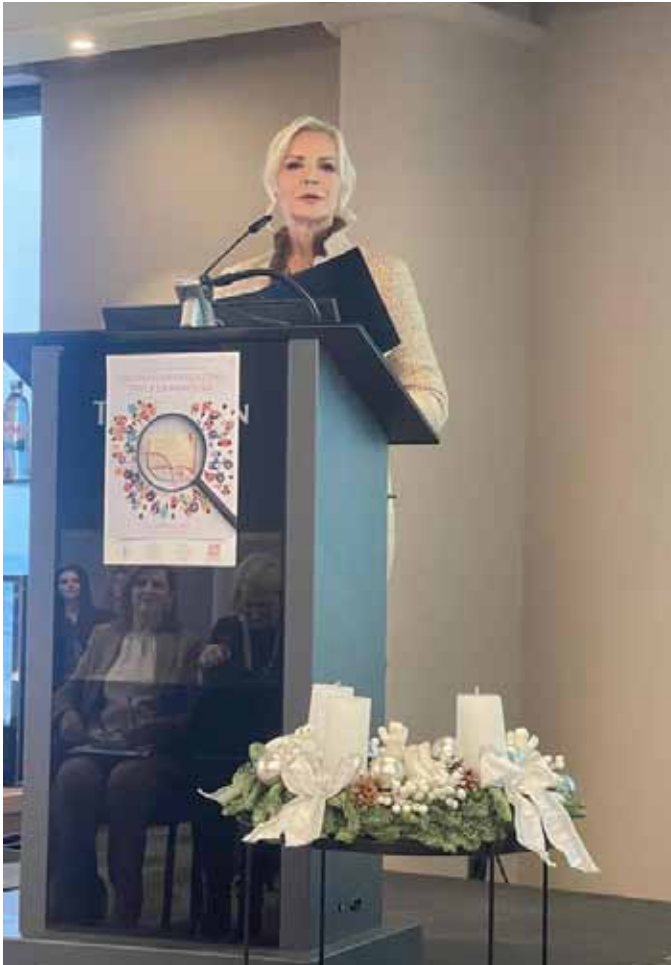
Figure 3. The Chair of the Organizing Committee of the 21st December Symposium, academician Mirna Šitum.

The presentations covered a wide range of topics within dermatovenereology, emphasizing both common and rare dermatological conditions. Residents discussed diagnostic challenges and management strategies for rare autoimmune and inflammatory conditions, offering insights into differential diagnoses and treatment protocols. Furthermore, presentations also covered rare and atypical skin tumors, the clinical manifestations of metastatic melanoma, and the side effects of emerging oncological therapies. The importance of early detection and the role of dermatologists in coordinating multidisciplinary care were recurrent themes. Lastly, infectious diseases, sexually transmitted infections, metabolic skin conditions, and vasculopathies were explored, emphasizing their prevalence in general dermatological practice and the need for accurate diagnosis and effective treatment.