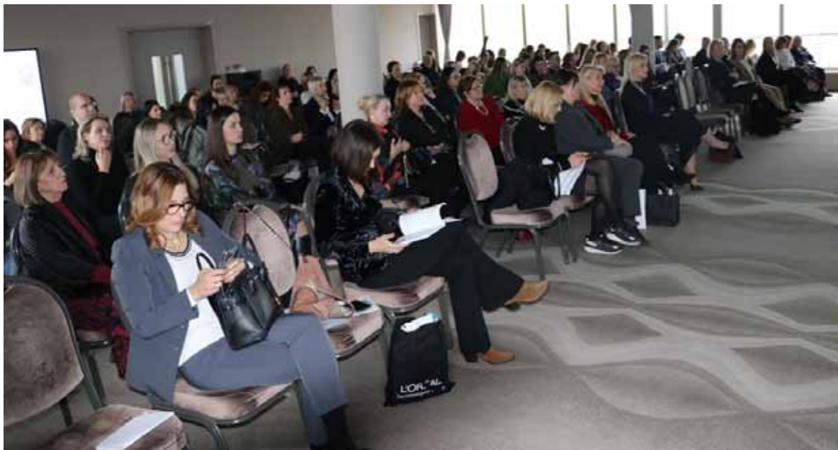
Figure 4. The fully attended venue reflected the significant interest of dermatologists and other specialists in this year's December Symposium.

In conclusion, the 21st Dermatovenereological Symposium successfully showcased the expertise, innovation, and collaborative spirit of Croatia's dermatological community. It reinforced the critical role of interdisciplinary approaches in addressing dermatological challenges and set a benchmark for future educational and professional gatherings in the field.