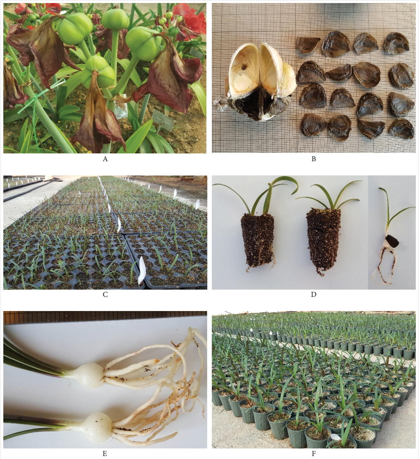
Figure 1. The hybridization process until the formation of initial bulblets in amaryllis Hippeastrum x hybridum Hort. (Photo by the researcher). A: Crossing and seed formation inside capsules; B: the seeds harvested with shell papery; C: the seeds germinated in the sowing tray and substrate; D: a view of the initial seedlings as well as the seeds and newly formed bulblets (70-day-old seedlings); E: a view of the bulblets with roots after 70 days; F: the size of six-month-old seedlings taken from the cross.