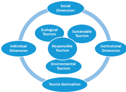
FIGURE 2: Semantic dimensions encompassing Responsible, Ecological, Sustainable and Environmental Tourism.

The analysis of responsible action has resulted in the study of two specific aspects of behavior: