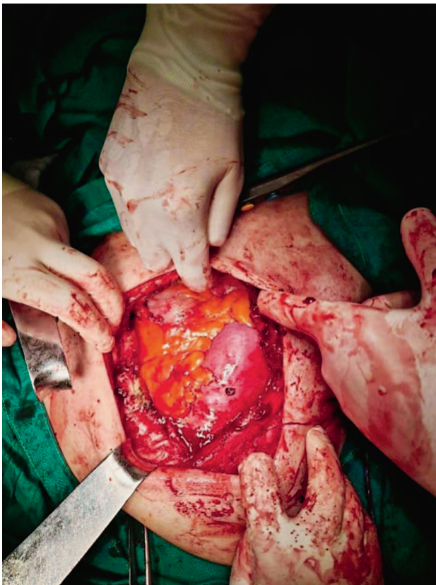
Figure 2. The condition after resection of the thoracic wall. Lung tissue and an orderly intrathoracic finding can be seen.