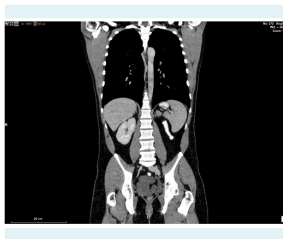
FIGURE 2. Multi-slice computed tomography with gastrografin showing renal agenesis and a multicystically dilated seminal vesicle.