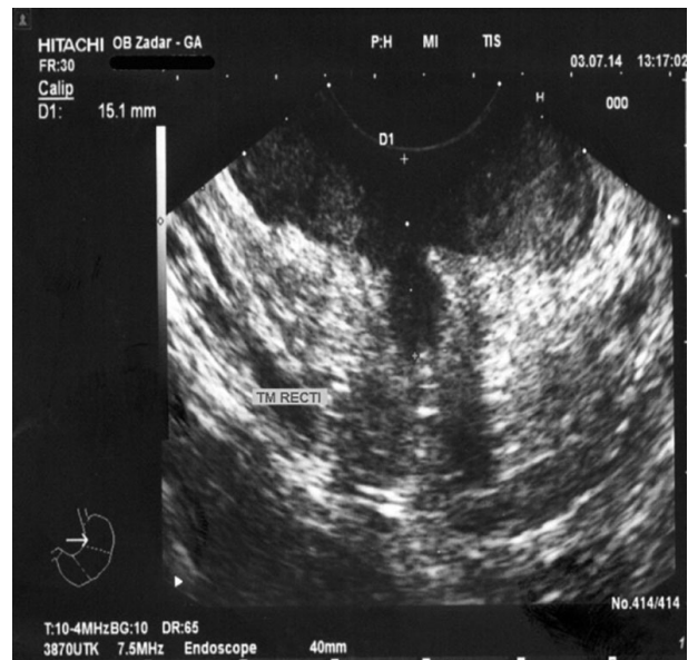
Fig. 1. Endoscopic rectal ultrasound (ERUS) findings in 64-year-old woman: tumor penetrates through all rectal wall layers and into the perirectal fatty tissue (T3N0). Postoperative pathological diagnosis confirmed the penetration into all layers and subserosa (pT3N0M0).

We demonstrated, albeit on a small sample of patients, that ERUS in the hands of an experienced endoscopist can be used to determine the size of tumor and degree of its penetration through the bowel wall with great certainty regarding the accuracy of the finding. This provides strong confidence when discussing local disease spread with surgeons and helps them determine the appropriate type of surgery. The final result is extremely important for therapeutic approach (Fig. 1).