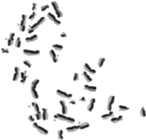
Slika 1. Strelicama je označeno devet razmjena u jednoj metafazi pacijentice sa SS-om Figure 1 9 exchanges are shown by arrows in a metaphase of a patient with SS