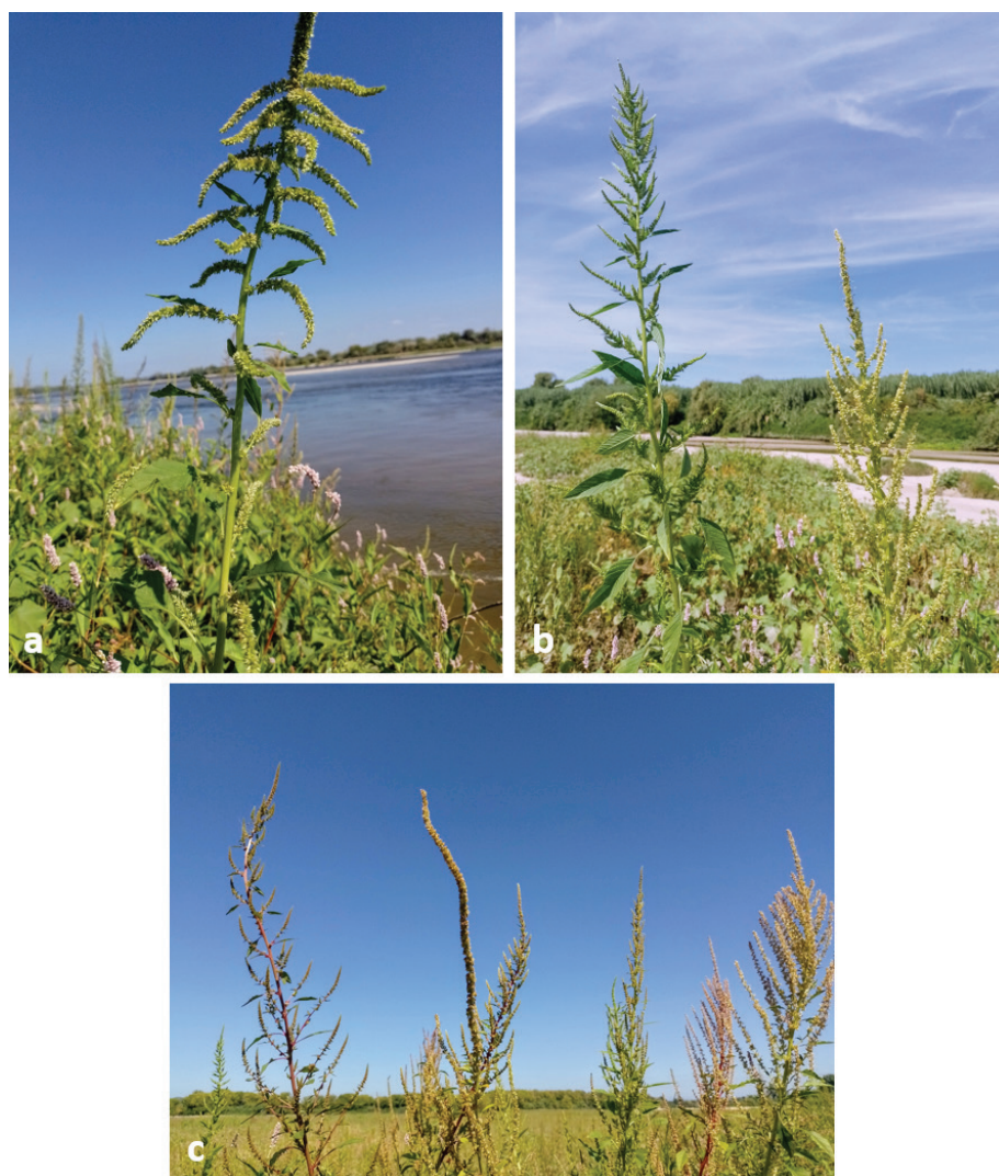
Fig. 2. Amaranthus tuberculatus on the banks of the Tagus River in Santa Iria da Ribeira de Santarém, 3 rd September 2024. As is often the case, the species is accompanied by Persicaria pensylvanica , another American invasive weed (a). Female (left) and male (right) individuals in Pombalinho, 11 th September 2024 (b). In Almeirim, 3 rd September 2024. The morphological variation of the species is great, especially regarding the colour and size of the plants, the branching pattern of the inflorescence, etc. (c).

five. Utricles are dark to reddish-brown, unribbed, and vary from obovoid to subglobose, 1.5–2 mm in size, with thin, nearly smooth to irregularly rugose surfaces. They may be indehiscent, irregularly dehiscent, or regularly dehiscent. Seeds are dark reddish-brown to dark brown, shiny, and measure 0.7–1 mm in diameter (adapted from Mosyakin and Robertson 2003).