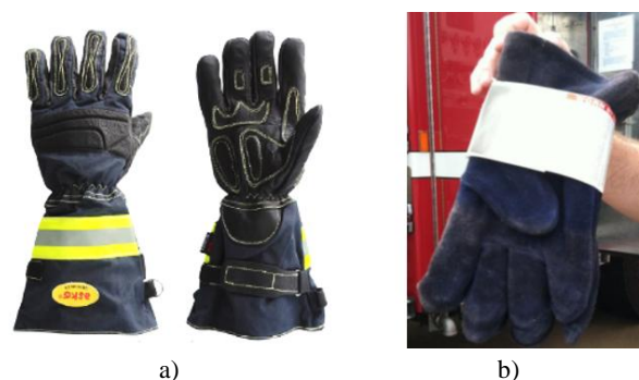
Fig.6 Firefighter gloves: a) textile gloves from Hemco LLC [21], b) leather gloves TechNote [29]