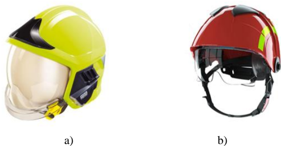
Fig.8 Firefighter helmets: a) for structural firefighting, MSA company [14], b) for fighting wildland fires and technical rescue, producer PAB Akrapović LLC [36]