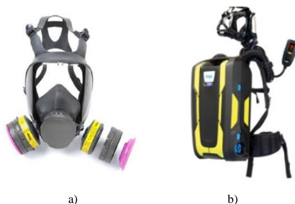
Fig.9 Respiratory protection equipment: a) full-face mask with filter, manufacturer Moldex-Metric, Inc. [38], b) self-contained breathing apparatus BG ProAir, Dräger company [39]

The self-contained breathing apparatus (Fig. 9b) is used in interventions where there is a risk of a toxic and hazardous atmosphere with oxygen deficiency, e.g. in unfavourable hazardous conditions in an enclosed space [31]. Its use ensures that a firefighter is supplied with a sufficient amount of breathing air (oxygen) to be able to work and survive in a specific location for a certain period of time [7].