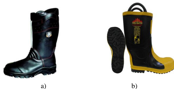
Fig.7 Firefighter Firefighting boots: a) leather boots from Vökl company [33], b) rubber boots produced by Harvik Rubber Industries Sdn Bhd [34]