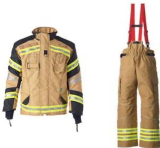
Fig.3 A two-piece suit (jacket and overalls) for structural firefighting from MSA company [14]

Fig.3 shows a structural firefighting garment (two-piece suit; jacket and overalls) produced by MSA company. As this is a two-piece suit, there must be a sufficient overlap between jacket and overalls in all working positions (usually 30 cm) [4]. As a rule, the suits for this purpose consist of three or four layers, which make up: