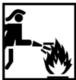
Fig.2 Pictogram of protective clothing for firefighters according to ISO 13688 [7]

All three subgroups are labelled in accordance with ISO 13688 and the corresponding pictogram for this clothing is shown in Fig.2.