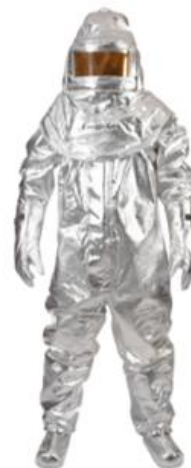
Fig.5 IST company's reflective suit for specialised firefighting [24]