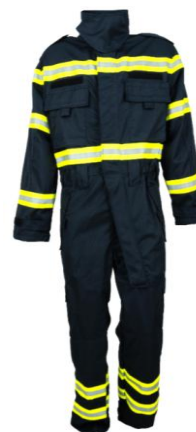
Fig.4 A coveralls from Hemco LLC for wildland firefighting [21]

This type of protective clothing as well as that for fighting structural fires can be manufactured as coveralls or two-piece suits, which must completely cover the human body and not restrict freedom of movement during work. This clothing is labelled in accordance with ISO 13688 and includes the number and name of the standard, a pictogram and the performance level achieved (A1, A2 or both) [4]. The basic requirements that the materials must fulfil can be found in Tab.2.