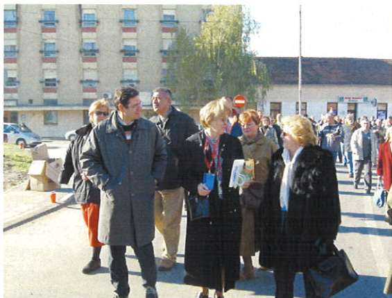
Members of the HATZ in the memorial procession

conferences. We should also have in mind the cooperation on the European projects, some of which have very simple procedures of joining, for the inclusion on such projects is what is needed as much as possible. Neither the bilateral cooperation should be discarded, nor the applications for international and European funds. Mr. Crnković stated that he does not expect this Congress to create miracles, but what he does expect from every individual are the ideas on how to contribute the cooperation.