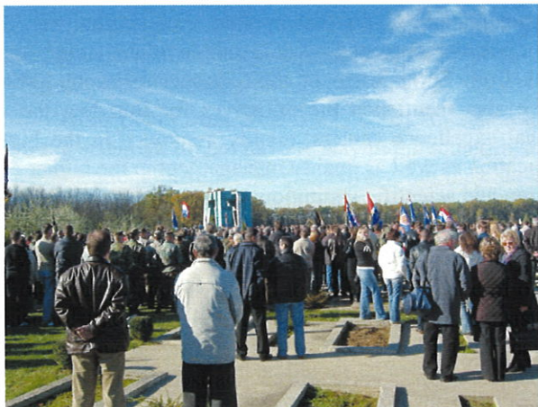
Participants of the Congress during the commemorative ceremony at the Vukovar Cemetery