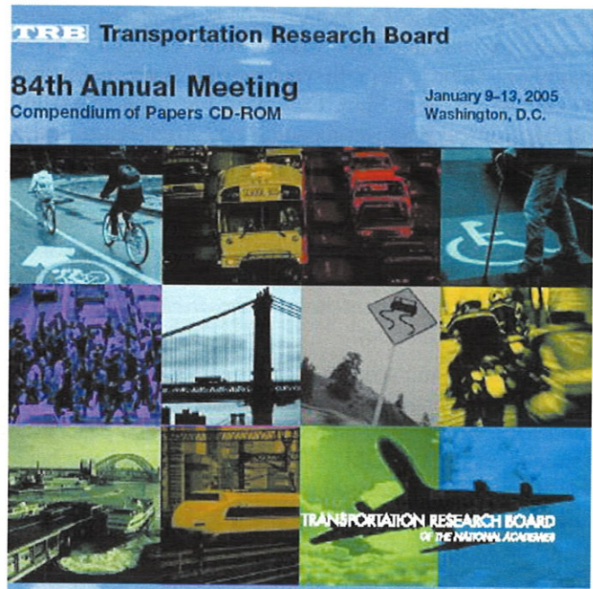
Official poster of the Meeting