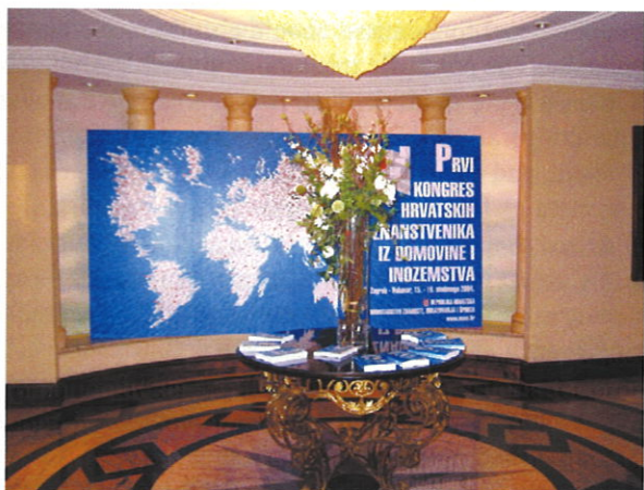
Hotel "The Westin" Zagreb