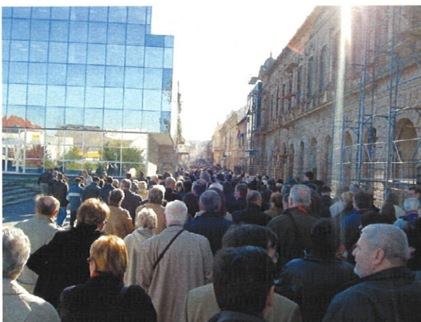
Memorial procession heading towards the Vukovar Cemetery