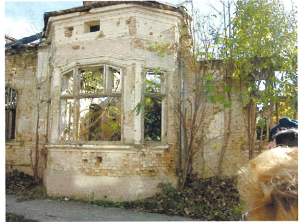
Detail from Vukovar ruins