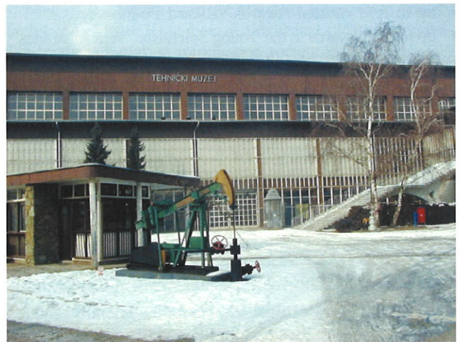
Technical Museum in Zagreb

Croatia from the broadest of views: professional, cultural, economic, educational, historical, sociological, interdisciplinary and others. Therefore, the invitations to the conference were sent to the broadest circle of possible participants. ... The papers cover topics from the history and appearance of technics in Croatia to the newest state, from education of young people to professional issues, from technical to lexicographical topics."