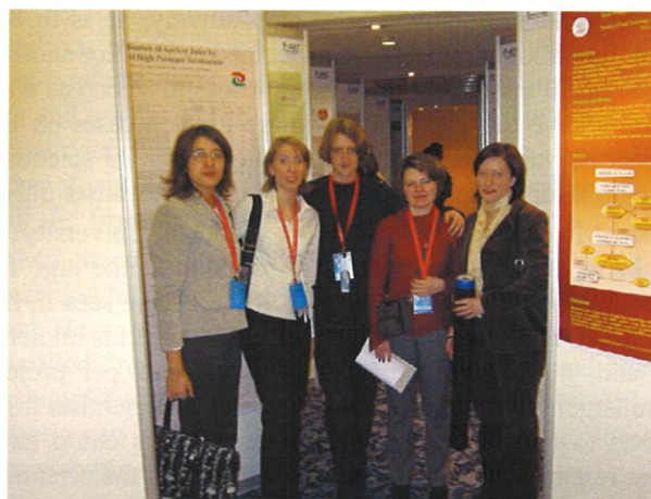
Young assistants at the Faculty of Food of Technology and Biotechnology, University of Zagreb

There were 12 plenary lectures at the Congress in total, and more than 90 participants were involved in the discussions.