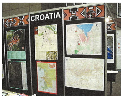
A detail from the international cartographic exhibition, Durban, 2003.