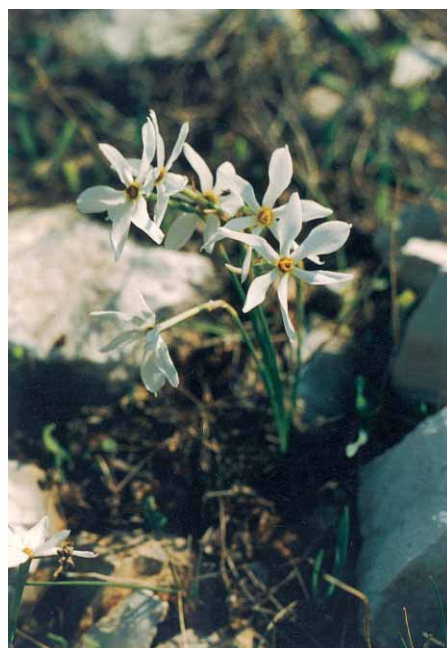
Fig. 2. and 3. Narcissus serotinus L., in group and individually. Lovište, Mirce, 23.9.1998.