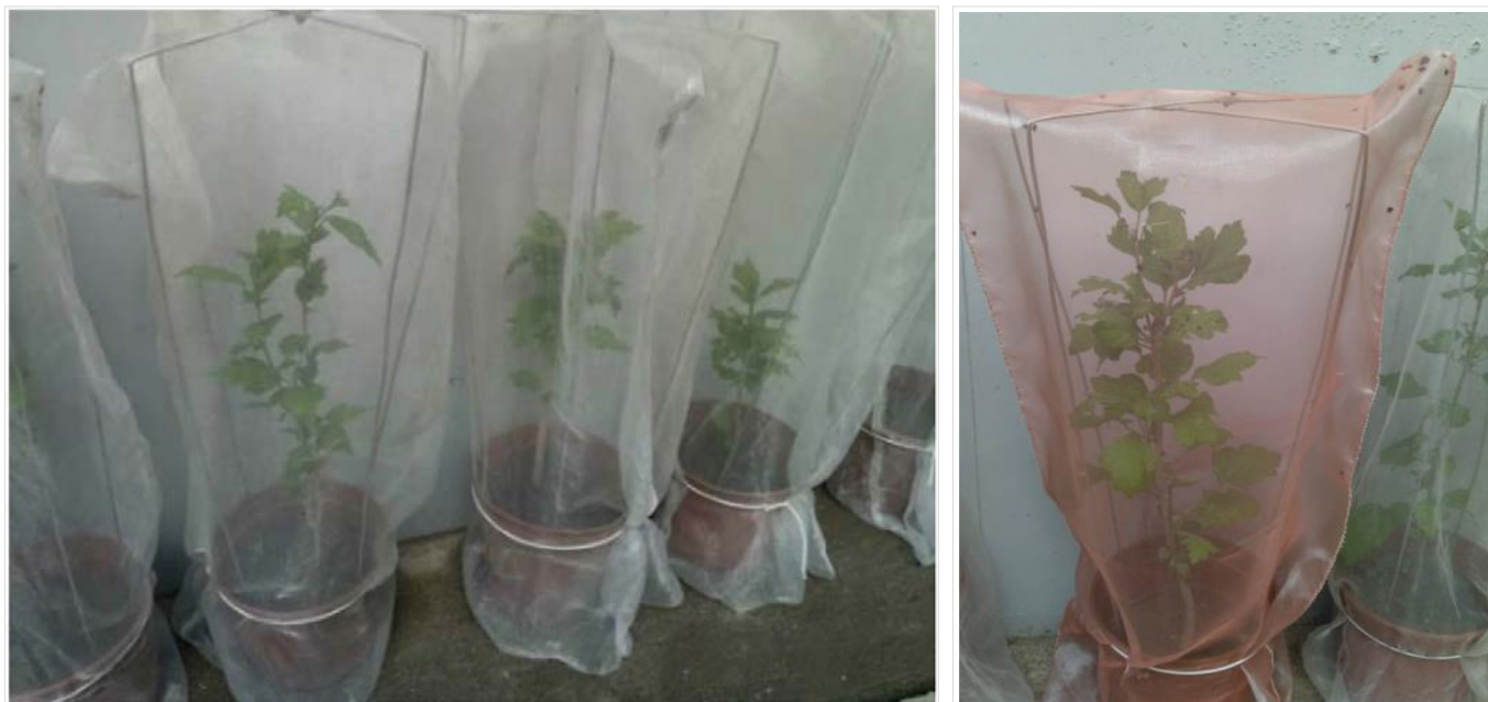
Figure 1. Outdoor isolators for studying the lifecycle parameters of the brown marmorated stink bug

from the isolator and placed in a new one. In this way, it was known that in each isolator, there were eggs laid on a specific date. The duration of the egg stage was studied on 111 eggs of the brown marmorated stink bug. After the eggs hatched, the duration of development of the nymphal instars and adult emergence was monitored. Nymphs that hatch from the respective egg cluster were observed daily until the first moult. As the nymphs passed into the second instar, they were moved individually to a new isolator, where observation of their transformation into the next instar and into adults continued. The date of emergence of the adults was recorded, and they were placed in a new isolator in pairs later. After the adults of the F1 generation emerged, they were moved to a new isolator in single pairs (one female and one male) for mating and laying eggs.