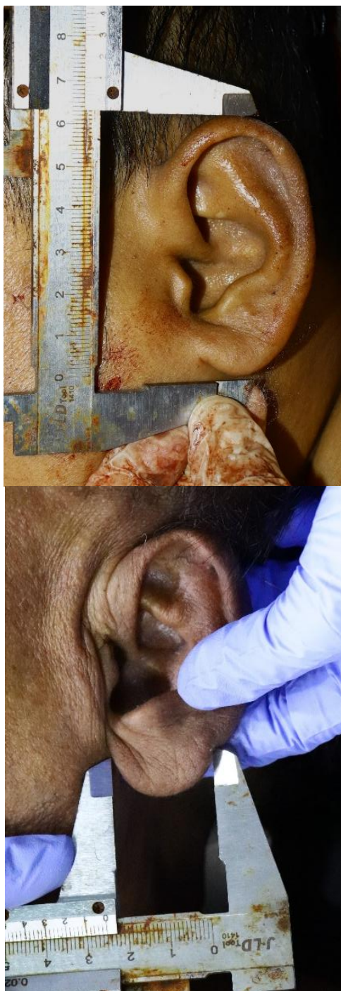
Figure 1. Measure of the ear taken with a vernier caliper.

from both ears would have strengthened the conclusions.