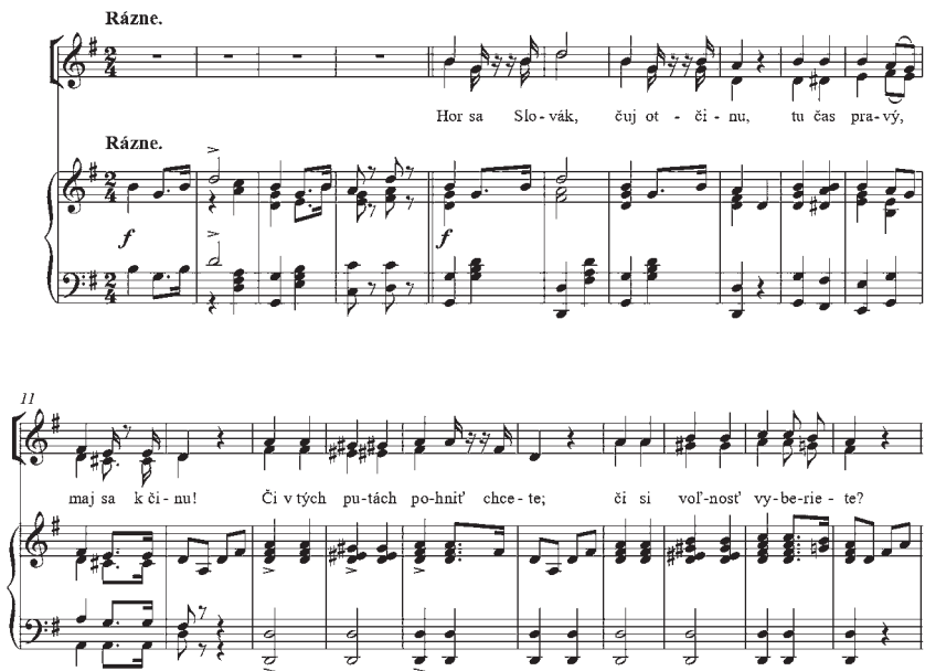
Music example No. 2: Mikuláš SCHNEIDER-TRNAVSKÝ (ed.): Tatranské zvuky. I. sošit; hymny a iné príležitostné spevy; na dva hlasy so sprievodom harmonia alebo klavíru: pre školu, Trnava: nakladom spolku sv. Vojtecha, 1926, 21, excerpt.

It should be noted that the Slovak composer Mikuláš Schneider-Trnavský (1881–1858) set J. Botto's text Hor sa Slováč to music in 1905 with his own melody, as a song accompanied by piano. 28