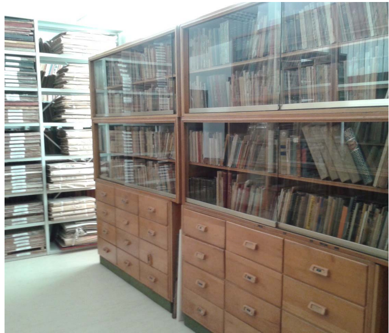
Slika 6. Dio bibliotečke građe Dizdarevog fonda Figure 6. Part of the library materials of the Dizdar Fund

is carried out continuously within the framework of the system, which to significant extent contributes to improvement of fund accessibility to researchers, academics and other users. Access to funds is enabled in accordance with the Library's Rules of Procedure, ensuring systematic, professional and permanent availability of this cultural and scientific resource.