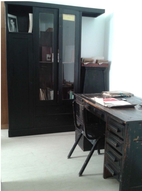
Slika 5. Radni sto, stolica i ormar Hamida Dizdara

se odvija u okviru tog sistema, što u značajnoj mjeri doprinosi unapređenju dostupnosti fonda istraživačima, naučnim radnicima i ostalim korisnicima. Pristup fondu se omogućava u skladu s Pravilnikom o radu Biblioteke, čime se osigurava sistemska, profesionalna i trajna dostupnost ovog kulturnog i naučnog resursa.