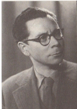
Slika 1. Hamid Dizdar (1907–1967) Figure 1. Hamid Dizdar (1907–1967)