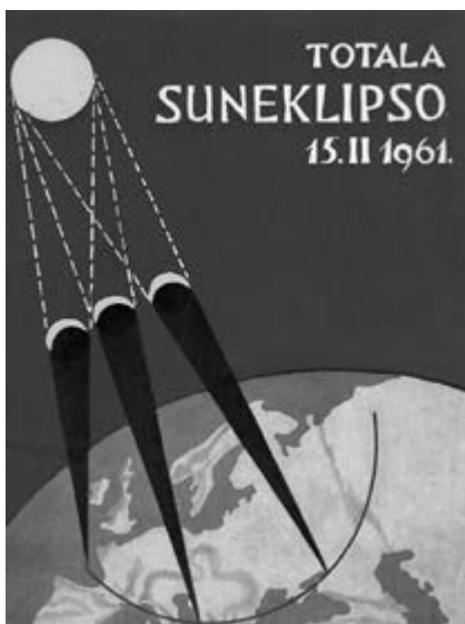
SLIKA 15. Naslovnica knjižice Totala Suneklipso 15. II 1961.