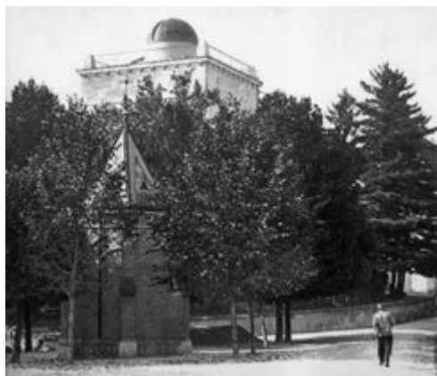
SLIKA 3. Zvezdarnica na Popovu tornju 1904. godine

Kučera je za Zvezdarnicu izabrao Popov toranj, kojega je grad Zagreb na tri godine ustupio na besplatno korištenje. Izgradnja zvezdarnice prikazana je ne samo kao utemeljenje znanstvene i kulturne ustanove, nego i kao rodoljubni čin. Za prvoga predstojnika izabran je dr. Oton Kučera, a sve do 1918. Zvezdarnica je dobivala godišnju vladinu potporu od 500 kruna, pa i više (sluke 3, 4).