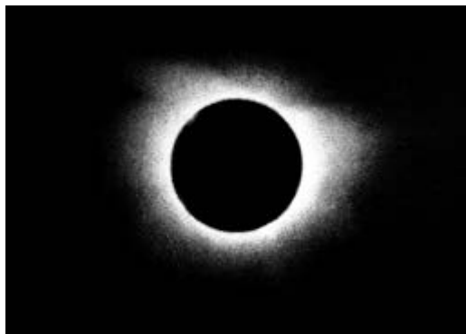
SLIKA 12. Korona snimljena specijalnom kamerom

situations could be used. The lens was mounted on a ring with three pairs of screws so as to make it easier to follow the lens optical axis direction. An iris curtain, or shutter, was mounted in front of the lens making it possible to regulate the amount of light to come onto the lens. A part of the camera used as a guide for inserting cartridges with photographic plates was oriented in the direction east-west prior to direct recording of corona, using the image of the sun on frosted glass. Camera barrel was made of a light and strong metal, bent into a broad tube, into which a smaller tube is inserted. This is used to