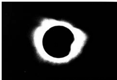
SLIKA 13. Pojava dijamantnog prstena prigodom potpune pomrčine Sunca na Hvaru

information globally on the Esperanto translation of Drama in Space (Tragedio en la Universo) , of the natural beauties of Croatia and of the International camp for the friends of world piece in Primošten as