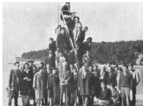
SLIKA 10. Članovi ekipe zagrebačke Zvjezdarnice koji su promatrali totalnu pomrčinu Sunca 15. veljače 1961. u Hvaru FIGURE 10. Members of the Zagreb Observatory team in charge of observing total solar eclipse on February 15th 1961 at Hvar

efforts to establish a department of astronomy at the University of Zagreb failed. This is why its important role in Croatian society should be recognised, regardless of the fact that it did not grow into a scientific research institution. (20)