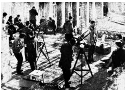
SLIKA 11. Jedno od promatračkih mjesta na tvrđavi Španjola u Hvaru

Mjesto gdje će opažači snimati pomrčinu izabrano je prema općim meteorološkim prilikama u zoni totaliteta u bivšoj Jugoslaviji. Izbor je pao na Hvar i staru tvrđavu Španjola ( slika 11 ) zbog pogodnog smještaja nad okolinom i brojnih terasa koje su poslužile kao izvrstan teren za postavljanje instrumenata. Na Hvaru su