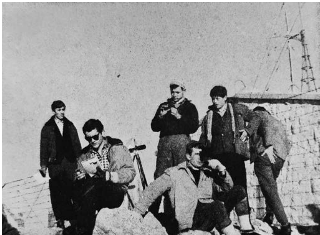
SLIKA 16. Posebna ekipa zagrebačke Zvezdarnice koja je opažala i snimala pomrčinu Sunca na planini Biokovo kraj Makarske

FIGURE 16. Special team from Zagreb Observatory that monitored and recorded solar eclipse at Mt. Biokovo, near Makarska