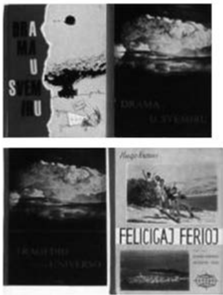
SLIKA 7. Naslovnice knjiga Drama u svemiru i Tragedio en la Universo te Felicigaj Ferioj ( Sretni praznici )