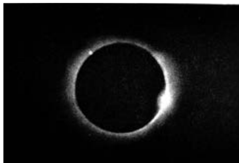
SLIKA 14. Kromosfera i protuberance na zapadnom rubu Sunca

FIGURE 13. Diamond ring appearing during the total solar eclipse on Hvar