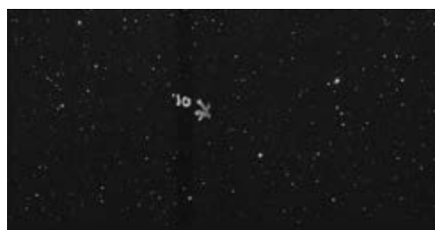
SLIKA 5. Fotografiska ploča oznake G4164 na kojoj je A. Kopff otkrio asteroid 589 Croatia; položaj asteroida je obilježen strjelicom i oznakom „10“

and was quite popular, as well as with the foundation of the Observatory and the Astronomical section in the HPD in 1902, provoked animosity, better to say concealed envy and jealousy, on the part of some of some of his powerful colleagues. It was even more obvious when Kučera successfully proposed the name Croatia for an asteroid at a conference in Heidelberg ( Figure 5 ). The asteroid was discovered by the German astronomer August Kopff (1882–1960) in 1906, from the observatory in Heidelberg, headed at that time by the astronomer Max Wolf (1863–1932). Giving the name to the asteroid was, in fact, an honour to the foundation of the HPD Observatory in Zagreb. (4)