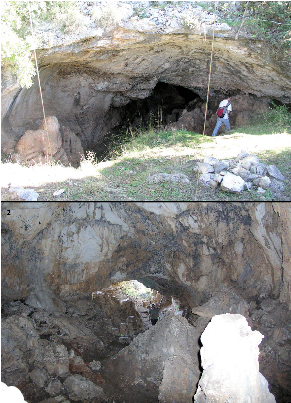
SLIKA 1. Špilja Kopačina: 1. pogled na prednji dio špilje; 2. pogled iz unutarnje dvorane prema ulazu (izradio: M. Vuković; snimio: N. Vukosavljević 2006. godine)