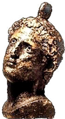
SLIKA 7. Brončani uteg – bista mladića, 3. st. pr. Kr. (preuzeto iz: СОКОЛОВСКА 1980: br. 332)

FIGURE 6 Golden ring, from the the Manastir site, 3rd-4th century (after СЛАМКОВ 2012: 45)