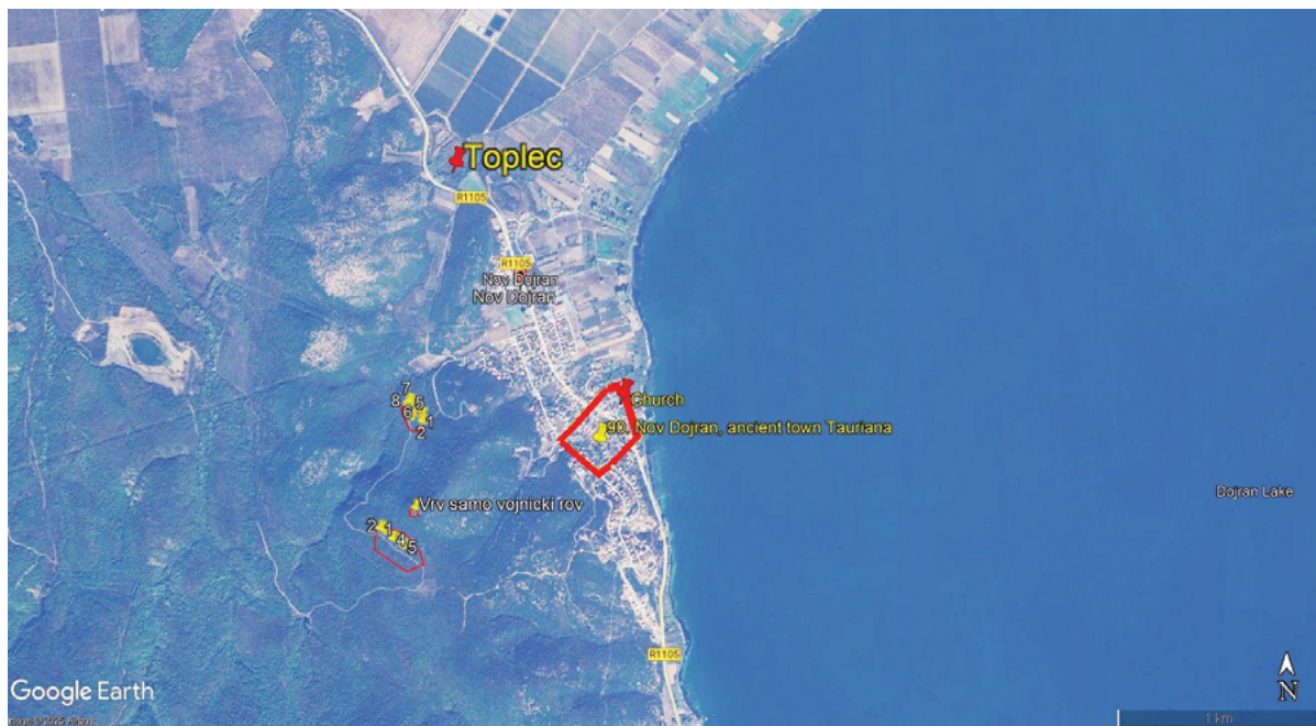
SLIKA 4. Položaj Tauriana u Nov Dojranu i arheološko nalazište Toplec

FIGURE 4 The position of Tauriana in Nov Dojran and the archaeological site of Toplec