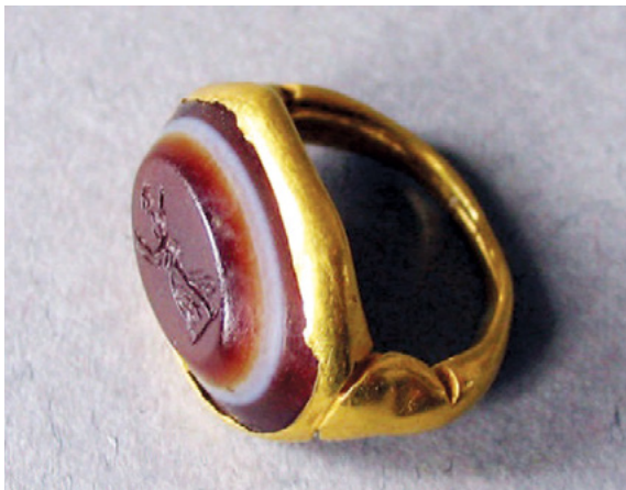
SLIKA 6. Zlatni prsten s lokaliteta Manastir, 3. – 4. st. (preuzeto iz: СЛАМКОВ 2012: 45)

FIGURE 5 Clay lamp from the the Manastir site, 3rd-4th century (after СЛАМКОВ 2012: 45)