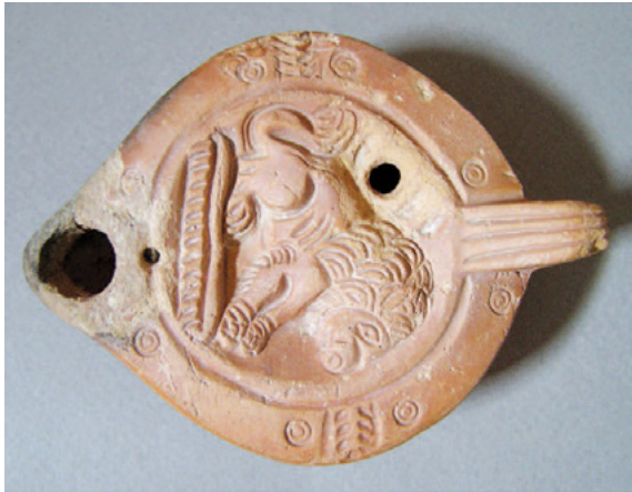
SLIKA 5. Glinena svjetiljka s lokaliteta Manastir, 3. – 4. st. (preuzeto iz: СЛАМКОВ 2012: 45)

FIGURE 5 Clay lamp from the the Manastir site, 3rd-4th century (after СЛАМКОВ 2012: 45)