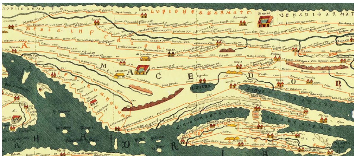
SLIKA 1. Tabula Peutingeriana , Segmentum VII – K. Miller, mapa s prikazom Makedonije

Several ancient cities and fortresses in Macedonia were strategically positioned along the route of Via Axia. These urban centres