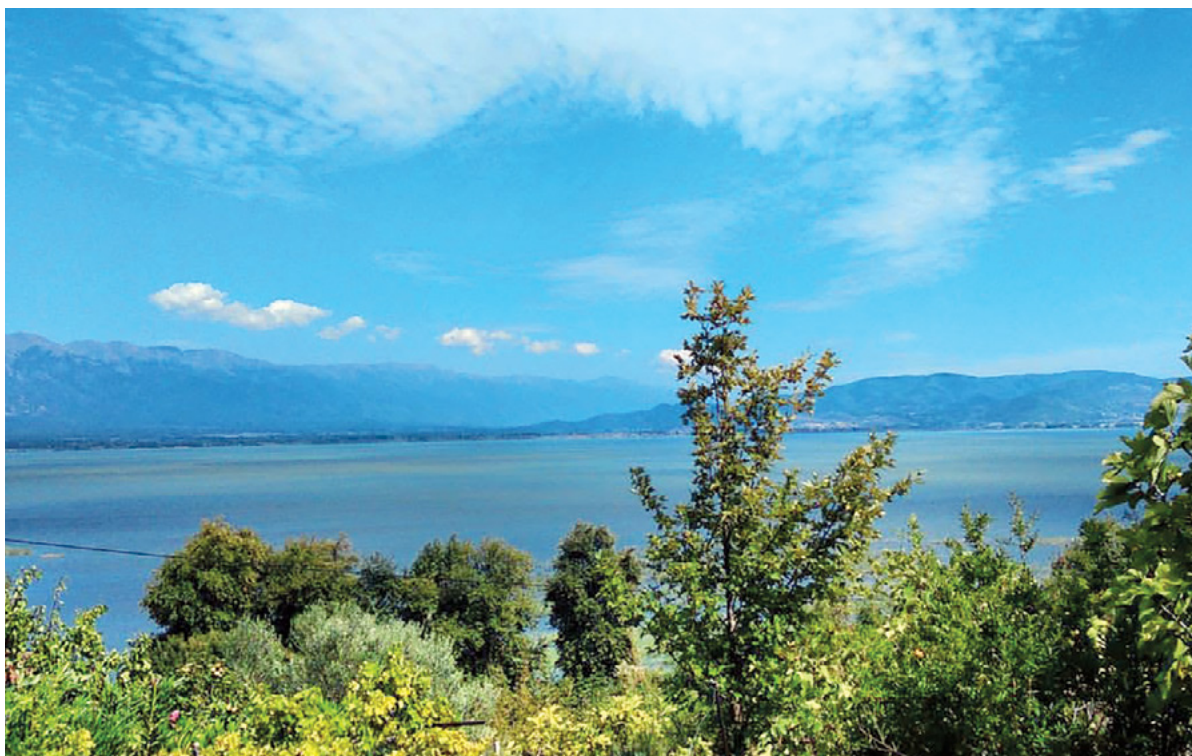
SLIKA 3. Pogled s Nov Dojrana na Dojransko jezero FIGURE 3 View from Nov Dojran towards Dojran Lake

S druge strane, neki istraživači dovode u pitanje ovu identifikaciju, sugerirajući da je riječ o rimskoj cestovnoj postaji Tauriani, označenoj na Tabuli Peutingeriani . 9 N. G. L. Hammond, međutim, postaju Taurianu, zabilježenu na Tabuli Peutingeriani , smješta kod Polykastra u Grčkoj. 10