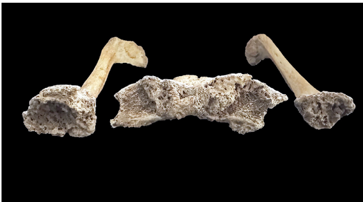
SLIKA 4. Promjene na spojevima manubrija prsne kosti i obje ključne kosti