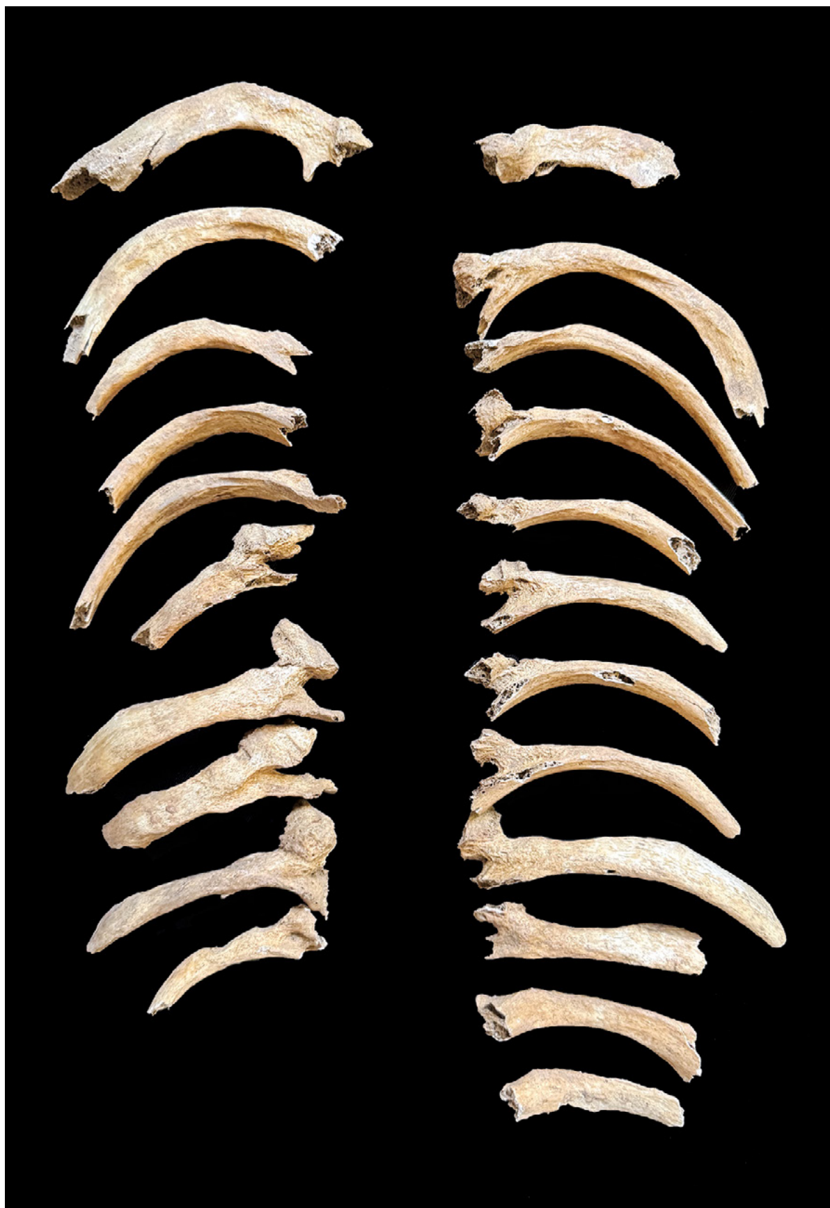
SLIKA 2. Prisutna rebra na kojima se uočavaju elementi ankiloze s prsnim kralješcima FIGURE 2 Present ribs showing elements of ankylosis with the thoracic vertebrae