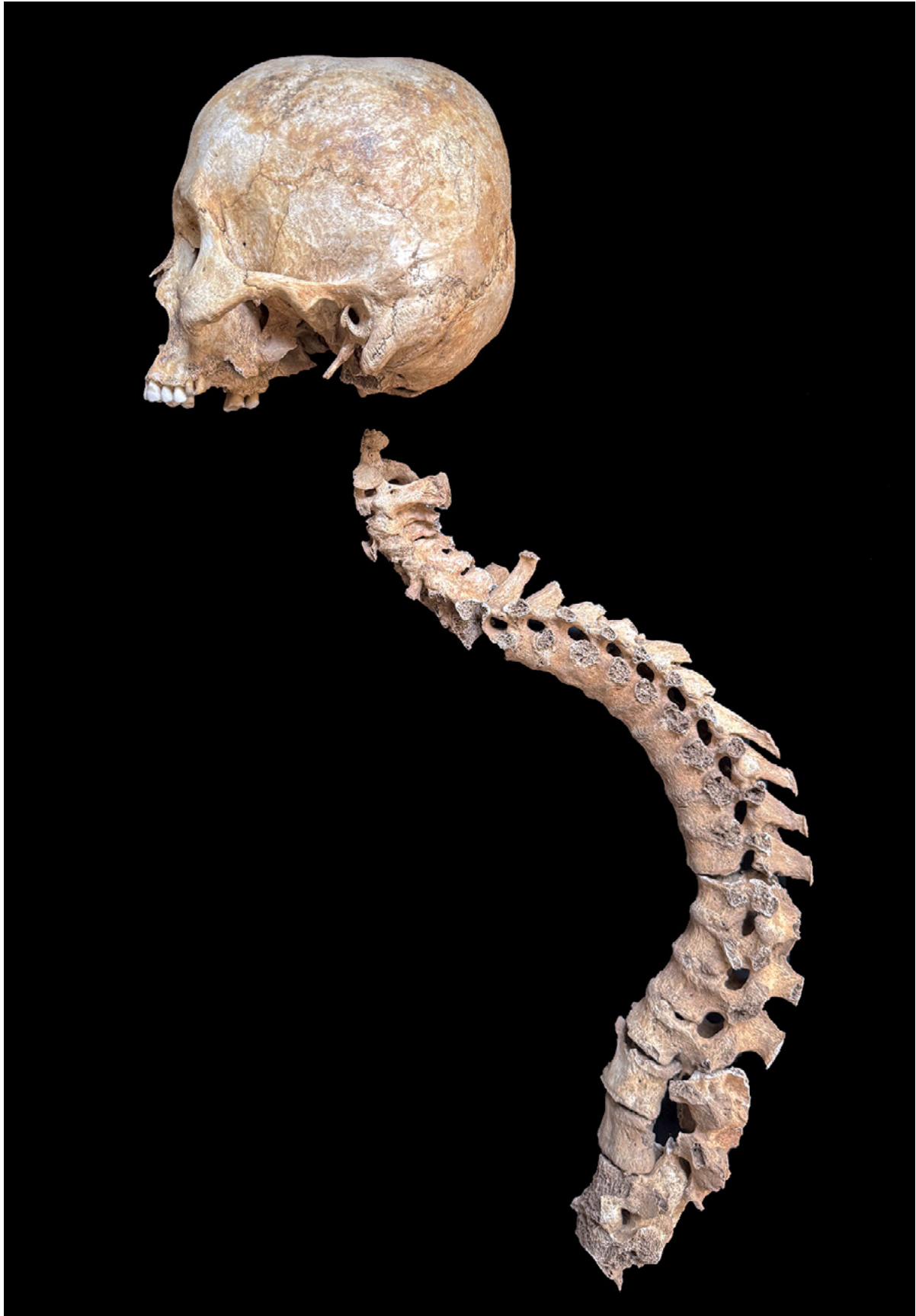
SLIKA 1. Ankiroza kralježnice koja upućuje na ankilozantni spondilitis FIGURE 1 Ankylosed spine demonstrating ankylosing spondylitis