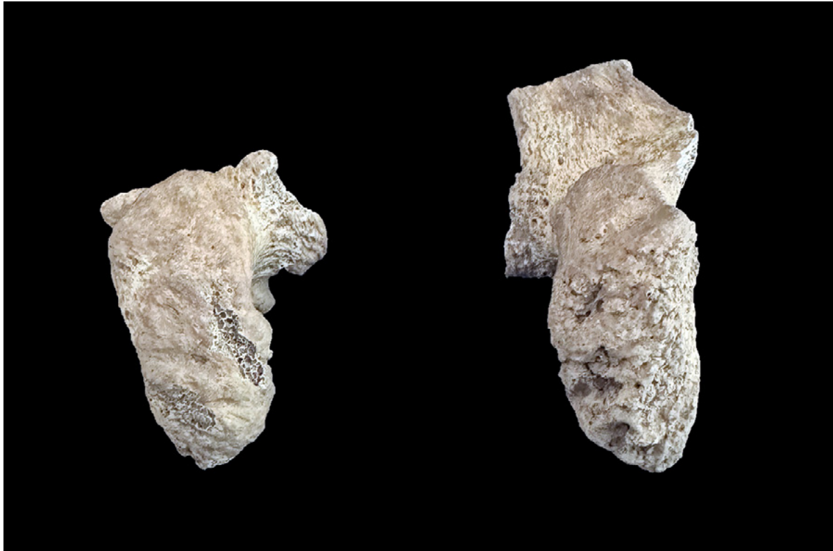
SLIKA 5. Burzitis na sjednim kostima FIGURE 5 Bursitis on the ischial bones

S obzirom na to da je ovdje riječ o osteološkim ostacima vrlo mladog muškarca koji je bolovao od posljednjeg stadija ankilozantnog spondilitisa, može se reći da je bolest napredovala vrlo brzo i agresivno. Uz današnja saznanja o tijeku i simptomima bolesti, kao i činjenici da sužavanje intervertebralnog prostora kod vratnih kralježaka posljedično dovodi do kompresije leđne moždine, 45 nije nelogično zaključiti da je ova osoba najvjerojatnije i umrla od ove teške bolesti.