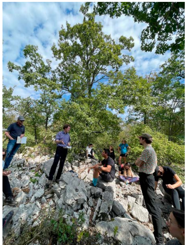
Figs. 3–5 Summer school Environmental History and Historical Ecology of the Dinaric Karst, Slovenia, 25–30 September 2023 .