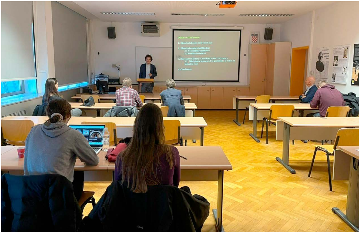
Fig. 2 Guest lecture by Žiga Zwitter in Zagreb in 2023.