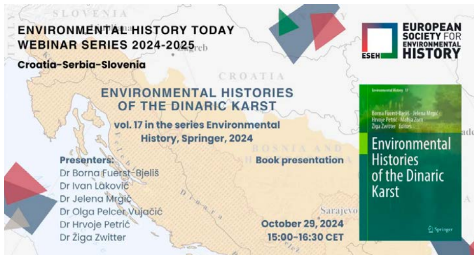
Fig. 7 Environmental History Today Webinar 2024

Faculty of Humanities and Social Sciences (Fig. 2), and the Department of Geography at the University of Zagreb's Faculty of Science (since 2019).