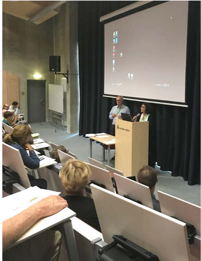
Fig. 1 Foundation of the ESEH Croatia–Slovenia–Serbia Region at the ESEH Ordinary General Meeting (OGM) in Tallinn in 2019.

Several important research projects, conferences, and publications with an emphasis on environmental history were carried out, held and published in the countries of today’s Dinaric Region or they contain contributions by authors from our region. Only those that contributed most prominently to the networking within the Dinaric Region are mentioned here. These are (1) the journal Economic- and Ecohistory: Journal for Economic and Environmental History ( Ekonomska i ekohistorija: Časopis za gospodarsku povijest i povijest okoliša ; since 2005; now Scopus-indexed, thanks to the editor-in-chief’s efforts), 10 (2) the globally most relevant environmental history conference ever held in the region – the ninth biennial ESEH conference Natures in Between: Environments in Areas of Contact among States, Economic Systems, Cultures and Religions (Universities of Zagreb and Zadar, 2017: 292 lectures, 9 round tables,