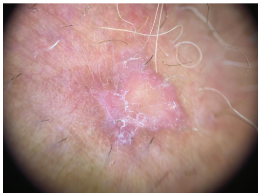
Figure 2. Elevated, erythematous margin with central superficial scaling.

has a marked male predominance, corresponding to >90% cases reported in clinical case series, and affects mainly adults (7). Case presentation is typically sporadic, but familial distribution suggesting an autosomal dominant transmission has been described in some cases (7).