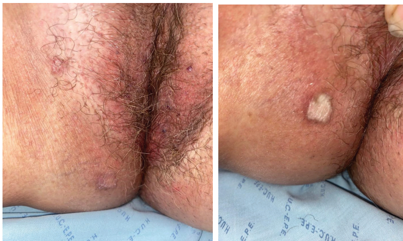
Figures 1 a and b. Erythematous lesions in perivulvar and intergluteal region

Porokeratosis ptychotropica (also known as verrucous porokeratosis of the gluteal cleft) is a rare, idiopathic disorder first described in 1995 by Luckert et al. , characterized by appearance of porokeratosis lesions in the gluteal or genital regions 5 . These are typically reddish-brown verrucous papules and plaques, which coalesce, expand centrally and may develop peripheral satellite lesions or porokeratosis in other areas, and which are typically pruriginous (2,6). It