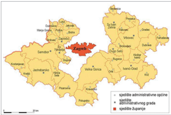
Figure 1. Zagreb County