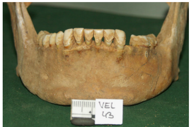
Calculus on mandibular anterior teeth