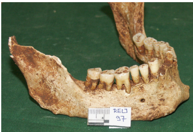
Alveolar bone loss

Gingival, or beginning periodontal disease, can be easily recognized in the clinical patient, but cannot be verified in osteological material. Many difficulties exist regarding the results of periodontal disease in osteological material: first, postmortal damage caused by ground storage may be found in sensitive alveolar bone (manifestation of decomposition); second, it is difficult to draw conclusions relating bone and soft tissue; third, insufficient findings exist concerning the effect of abrasion on the periodontium; and fourth, standardization regarding the recording of results is lacking. However, alveolar recession has been used by archaeologists as an indication of the severity of periodontal disease found in populations of former times.