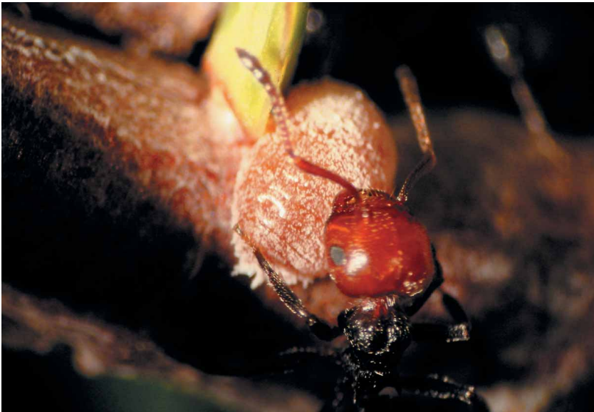
Fig. 3. Adult female of Planococcus vovae (Nasonov, 1908) attended by the ant Crematogaster scutellaris (Olivier, 1792)

P. vovae can be easily separated from P. citri and P. ficus on the basis of its host plant: P. vovae lives mainly on Cupressaceae whereas P. citri and P. ficus are poly-