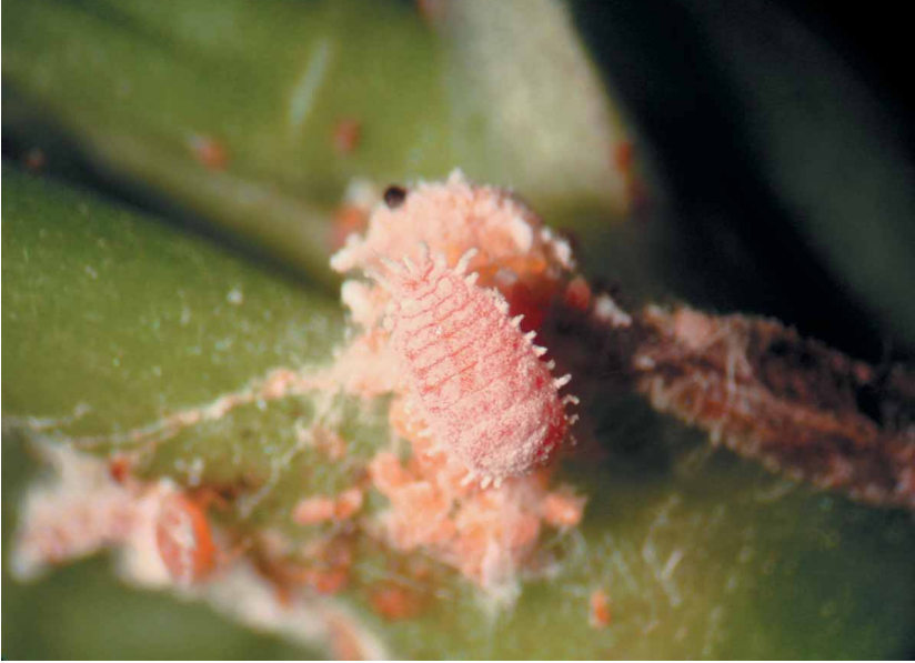
Fig. 1. Adult female of Planococcus citri (Risso, 1913)