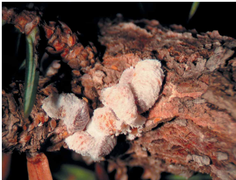
Fig. 4. Adult females of Planococcus vovae (Nasonov, 1908) with ovisacs and 1st instar larvae

phagous species not usually associated with coniferous plants. P. citri is well known as a very common pest in greenhouses while P. ficus is known as a grapevine pest. Macroscopic characters (i.e. shape and colour of adult female, waxy filaments) are not very useful to differentiate these three species, because they look very similar