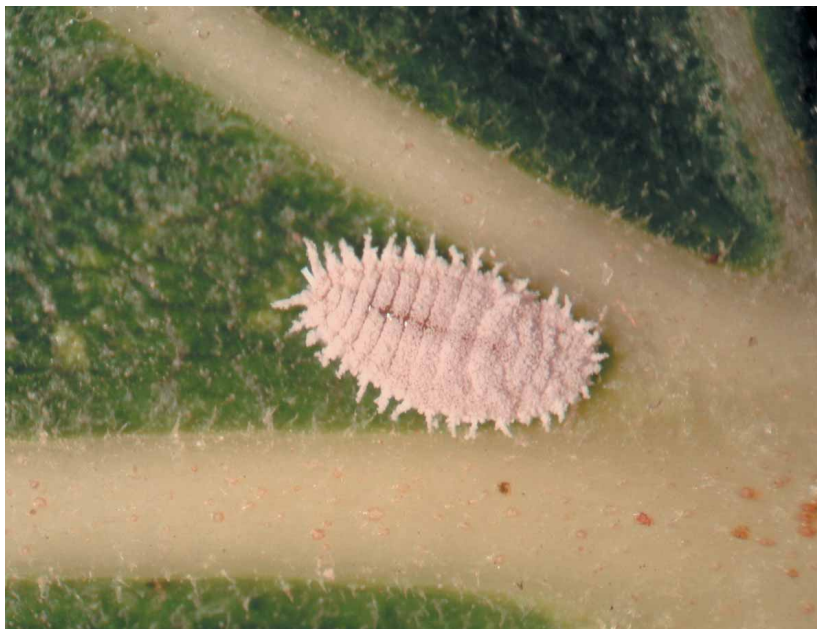
Fig. 2. Adult female of Planococcus ficus (Signoret, 1875)