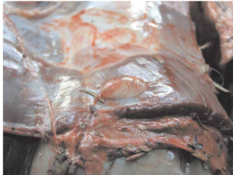
Fig. 2. Cysticercus tenuicollis in roe deer diaphragm

From the given number of animals, fourteen were positive, with a total prevalence of 12.28 %. Among the individual hosts the highest invasion rate occurred in roe deer, followed by red deer and lastly fallow deer (Tab. 3). C. tenuicollis was found in one four year old host, localized on the mesentery, omentum, abdominal cavity (Figs. 1, 2, 3), lung (Fig. 4) and liver. C. cervi was found in the myocard of 2 red deer and 3 roe deer.