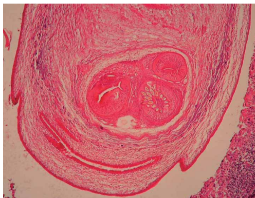
Fig. 4. Neck region of Cysticercus cervi : (H&E, heart, 20 x 10)