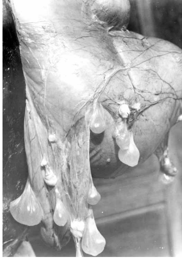
Fig. 1. Cysticercus tenuicollis in red deer