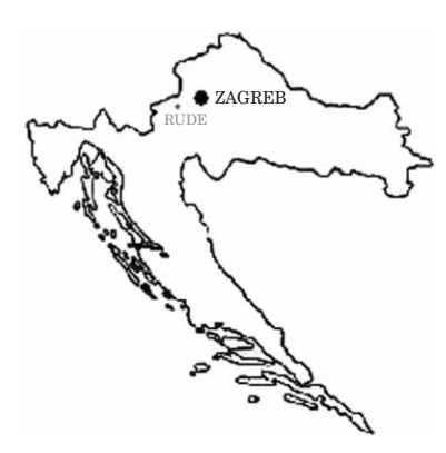
Fig. 1. Geographic location of the village of Rude.

In the past, the village was well-known area of severe iodine deficiency, and therefore the object of many epidemiological investigations. Endemic goiter was the most common disease of the village population. In 1952, distinguished Croatian endocrinologist Professor Josip Matovinović carried out detailed village survey<sup>2</sup>. The goiter was detected in 83% of 865 individuals with increasing prevalence with age. Goiter prevalence in schoolchildren and adolescents was 85.0%. It was the place with the highest prevalence of goiter in Croatia before the introduction of compulsory salt iodination in former Yugoslavia in 1953. Professor Matovinović<sup>3</sup> gave detailed description of the life in the village at the beginning of the 1950's: »The houses were small and over-crowded, with an average of five family members per household. The essential dietary products were corn bred, potatoes and beans, with little meat or milk. Wine was an important source of calories – 7.4% drank more than one liter per day, and 83% of children consumed alcohol«. A young girl