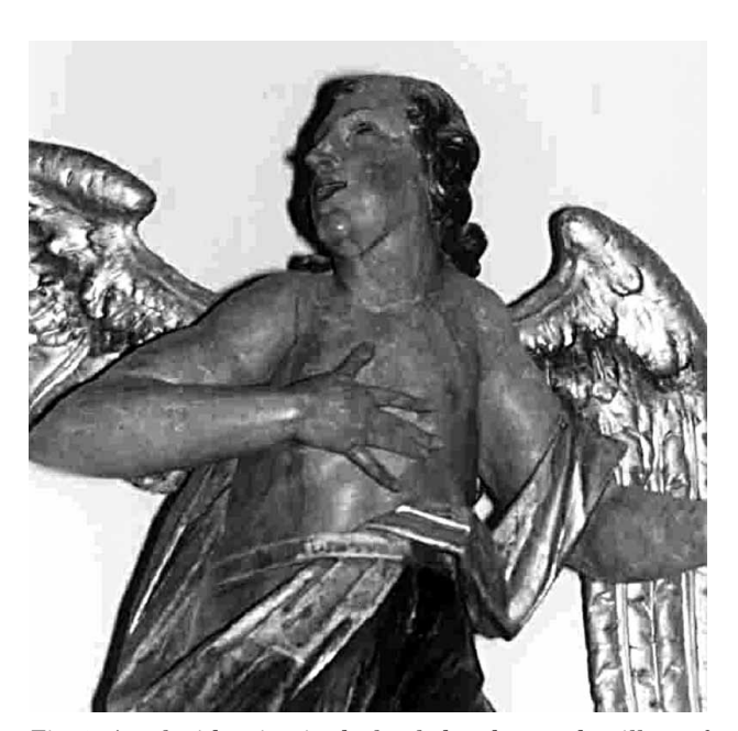
Fig. 2. Angel with goiter in the local church near the village of Rude, where 85% of the children had goiter in 1950'.

In the past, the village was well-known area of severe iodine deficiency, and therefore the object of many epidemiological investigations. Endemic goiter was the most common disease of the village population. In 1952, distinguished Croatian endocrinologist Professor Josip Matovinović carried out detailed village survey<sup>2</sup>. The goiter was detected in 83% of 865 individuals with increasing prevalence with age. Goiter prevalence in schoolchildren and adolescents was 85.0%. It was the place with the highest prevalence of goiter in Croatia before the introduction of compulsory salt iodination in former Yugoslavia in 1953. Professor Matovinović<sup>3</sup> gave detailed description of the life in the village at the beginning of the 1950's: »The houses were small and over-crowded, with an average of five family members per household. The essential dietary products were corn bred, potatoes and beans, with little meat or milk. Wine was an important source of calories – 7.4% drank more than one liter per day, and 83% of children consumed alcohol«. A young girl