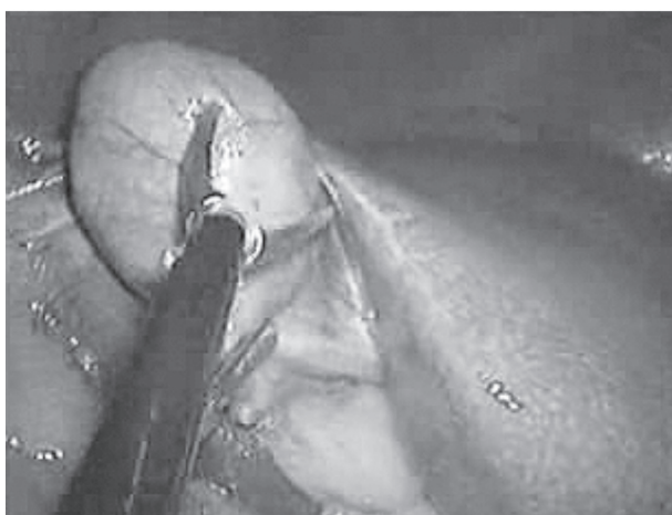
Fig. 2. Intraoperative view.

A 69-year-old female patient with chronic cholecystitis and concrements in the gallbladder that were verified by ultrasound was scheduled for elective surgery. She had no significant comorbidities. The patient's body weight was 72 kg, height 160 cm and body mass index (BMI) 28 kg/m 2 . The patient was placed and draped in standard manner. We made a single semicircular supraumbilical skin incision 2.5 cm long. After exposing the fascia, pneumoperitoneum was created with the Veress access needle. A 10-mm trocar was