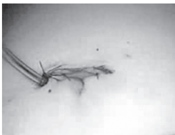
Fig. 4. Skin sutures and drain.

then introduced and the abdominal cavity was explored with a 10-mm 30-degree camera. Two 5-mm trocars were then inserted into the abdominal cavity, each placed 1 cm laterally and cranially from the 10-mm trocar (Fig. 1). Since the operator usually performs laparoscopic cholecystectomy without retracting the cholecyst, there was no need for placing stay sutures. Antegrade cholecystectomy 4 was performed (Figs. 2 and 3). The Calot triangle was exposed, all elements were identified, and cystic artery and cystic duct were clipped separately with a 5-mm clip applier. The gallbladder was emptied prior to removal and removed in an endobag through umbilical incision. The drain was inserted through the right 5-mm trocar (Fig. 4). The operation lasted 90 minutes. We used standard laparoscopic instruments, which proved to be technically demanding but feasible. Preoperatively, the patient received standard antibiotic