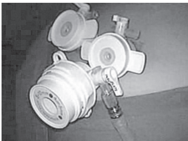
Fig. 1. Position of trocars.

perience with SILS cholecystectomy is promising, additional studies are needed to develop a safe and effective technique to be able to compare it with laparoscopic cholecystectomy as the gold standard.