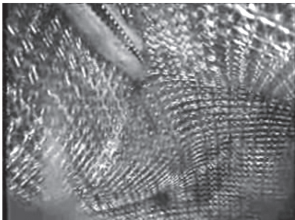
Fig. 4. Second MESH after placement.

4). The operation proceeded without complications and the operative time was 90 minutes. Postoperative recovery was uneventful. The patient was discharged after 48 hours.