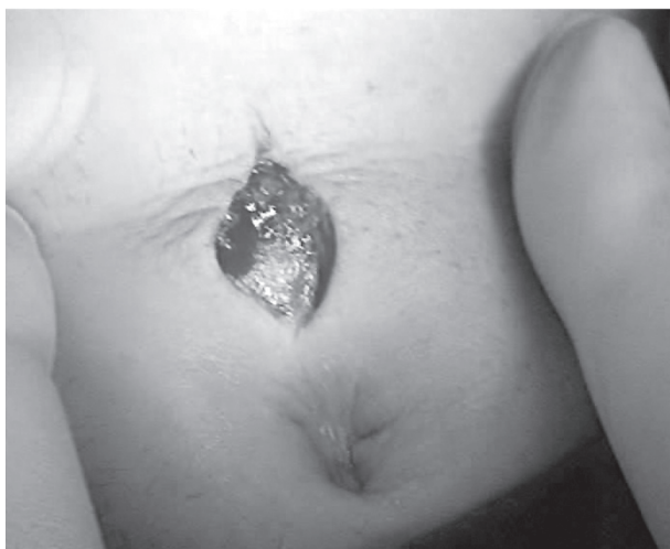
Fig. 1. Infraumbilical skin incision.

A 60-year-old male patient presented with unilateral right sided primary indirect inguinal hernia. Laparoscopic SILS totally extraperitoneal (TEP) repair was performed under general anesthesia. Standard antibiotic prophylaxis was administered. The patient was placed in supine position with a 10° to 15° Trendelenburg tilt and with the arms resting against the body. A single 2.5-cm infraumbilical incision was made (Fig. 1), the anterior rectus sheath was incised and a balloon dissection device was inserted over the posterior rectus sheath, guided to the pubic symphysis and inflated, resulting in separation of the peritoneum from the rectus muscle. This creation of the extraperitoneal space allowed for laparoscopic dissection to take place. Then the bal-