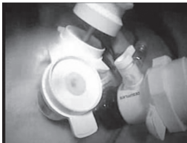
Fig. 2. Port placement.

loon device was removed and replaced with a 10-mm blunt-tip trocar for camera. Carbon dioxide was insufflated to a pressure not exceeding 12 mm Hg. Two 5-mm ports were inserted through the anterior sheath of the abdominal rectus muscle into now existing preperitoneal space, each placed 1 cm laterally from the laparoscope port (Fig. 2). The first step was to identify the key anatomic landmarks such as the pubic bone, Cooper's ligament, spermatic cord, inferior epigastric vessels running superiorly, and the type of hernia (direct hernia medially and indirect hernia laterally to the inferior epigastric vessels). The next step was to reduce the hernia sac from the inguinal wall (Fig. 3). The indirect hernia sac was reduced and separated from the spermatic cord. After the entire posterior floor had been dissected, double mesh was placed as previously described 8 (Fig.