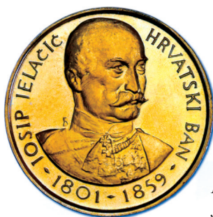
Double sided medal of Ban Josip Jelačić

phenomenon of the artist challenge for medal-makers and print-makers that tackled the topic of Ban Josip Jelačić as a historical personality. In addition, some of the personal items of the Jelačić estate are shown. The figure of Ban Josip Jelačić is very much present in the Croatian people's consciousness and he is often referred to and invoked, in difficult times in particular.