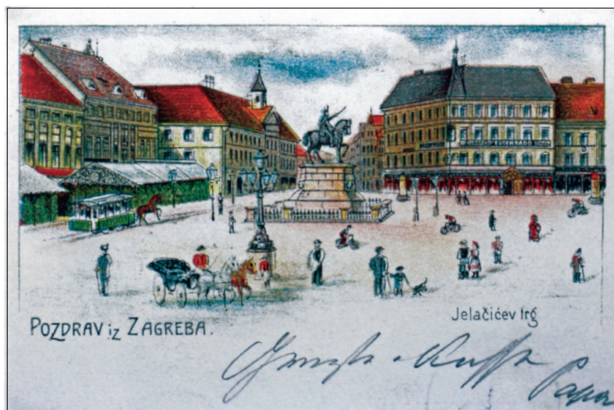
First picture postcards of Zagreb