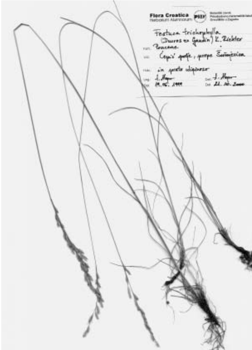
Fig.1. Festuca trichophylla (Ducros ex Gaud.) K. Richt.