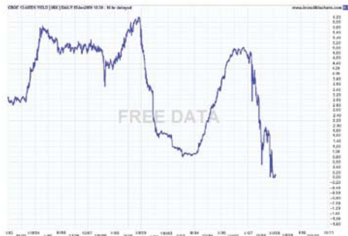
Slika 3 — Kretanje kamatne stope na 3-mjesečne trezorske zapise u SAD [2] Figure 3 — Fluctuations of interest rates on 3-month treasury securities in USA [2]

Almost zero interest on short-term money loans indicated to USA that the inter-financing of the banks, that is, the financing of the economy by the banks came to a stop. A revival of the economic activity in the USA will not happen before the demand for money starts to increase, and the first indication of this will be the growth of short-term interest rates.