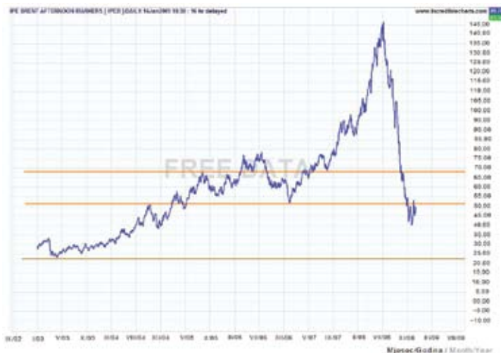
Slika 6 — Tehnička analiza Kretanje cijene nafte Brent [2] Figure 6 — Oil Price Fluctuation technical analysis Brent [2]

Nakon dosezanja dna krize, i započinjanja gospodarskog oporavka, uslijedit će i oporavak cijene nafte. Na kraći rok cijena nafte bi mogla porasti do razine oko 50 USD/bbl, odnosno srednjoročno do 70 USD/bbl, otprilike.