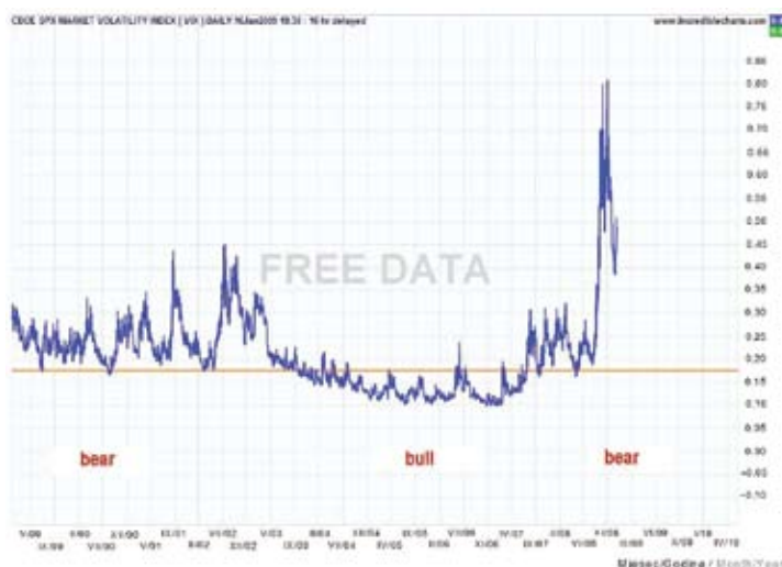
Slika 5 — FIndeks straha – VIX [2] Figure 5 — Fear Index – VIX [2]

However, the fear index - VIX of the S & P American Index indicates that there is great probability that the bottom of the crisis has not been reached yet (Figure 5).