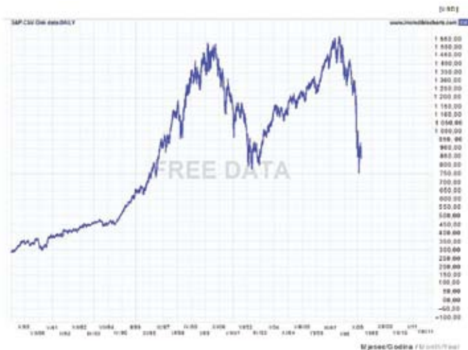
Slika 2 — Kretanje vrijednosti S&P 500 indeksa [2], [3] Figure 2 — S&P 500 index value fluctuation [2], [3]

A onda je uslijedila aktualna kriza. Greška u financijskoj sferi (zbog kolapsa hipotekarnog tržišta u SAD-u) dovela je do otkrivanja svih sustavnih slabosti. Bez kvalitativno novih proizvoda, realni sektor ostajao je bez jednog po jednog dijela potražnje, pa je i sam završio u krizi [1].