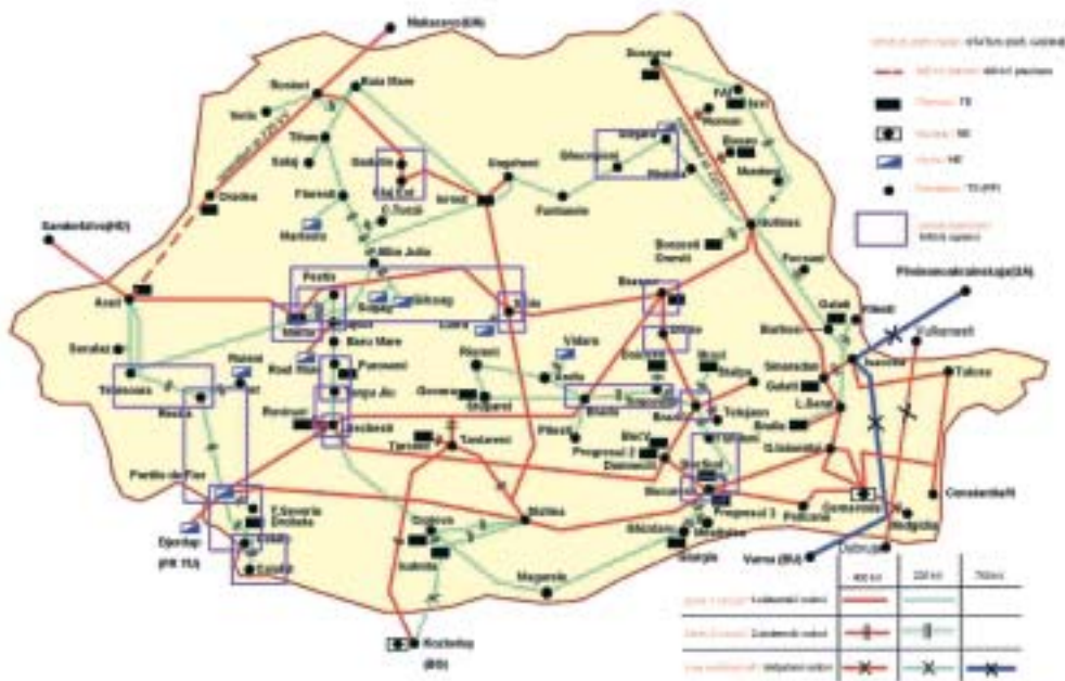
Slika 5 Kritične grane u Rumunjskoj s aspekta tržišnog angažmana elektrana jugoistočne Europe Figure 5 Critical branches in Romania in terms of market engagement of SEE power plants