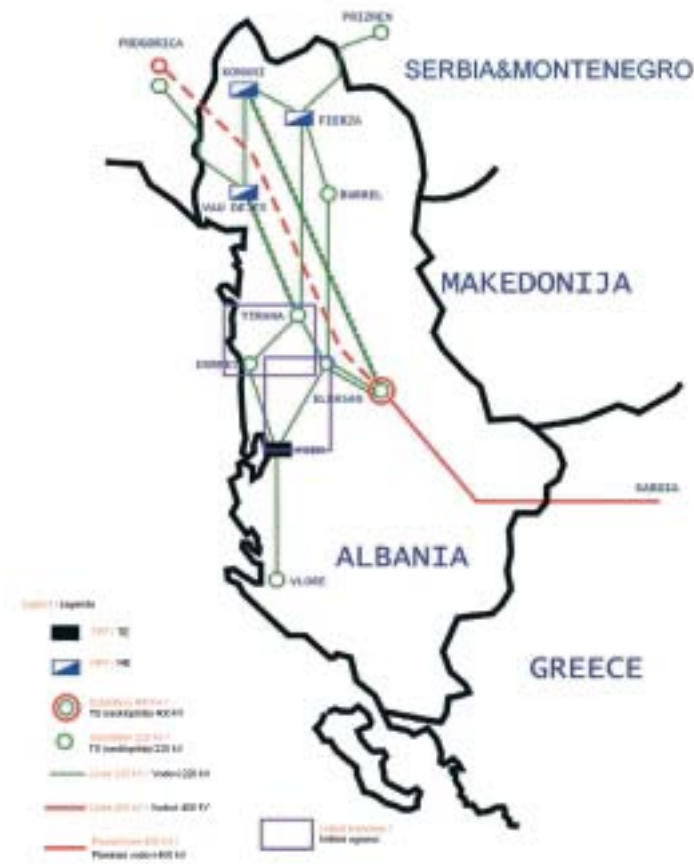
Slika 6 Kritične grane u Albaniji s aspekta tržišnog angažmana elektrana jugoistočne Europe Figure 6 Critical branches in Albania in terms of market engagement of power plants in SEE