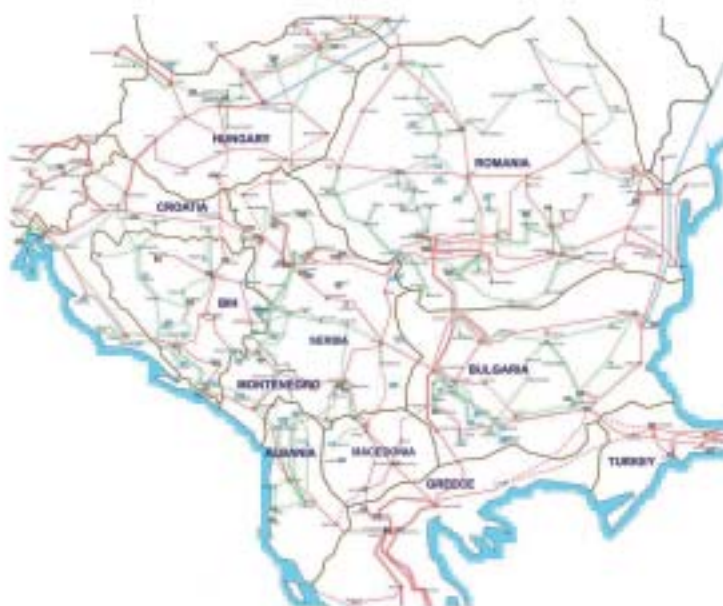
Slika 3 Prijenosna mreža jugoistočne Europe 2010. i 2015. godine (postojeći i planirani interkonekcijski vodovi) Figure 3 Transmission network of Southeast Europe in 2010 and 2015 (existing and planned interconnection lines)

Unlike the GTMax model, where the presentation of the SEE transmission system is very limited, the PSS/E regional model (RTSM) contains details of 400 kV, 220 kV, 150 kV and 110 kV branches, with the loads modelled at all the 110 kV nodes, plus a complete overview of power plants as a group of generators and their unit-transformers. The RTSM for the year 2010 contains a total of 4,182 nodes, 661 power plants and 752 generators, 2,824 loads, 5,144 lines and 1,238 transformers. The load limits within the RTSM include the definition of top allowed thermal loads of power lines and the apparent transformer power. The model defines the utilisation of each generator and the level of load at each node of the network where the load is modelled, plus the balance of each individual system (generation-load), and calculations of power flows and the (n-1) security analysis are carried out with regard to the given configuration of the network. The configuration of the SEE transmission network as modelled in the PSS/E is shown in Figure 3. The PSS/E model also includes the transmission networks of Slovenia, Hungary, West Ukraine, Greece, Turkey and the equivalent of the UCTE system. The configuration of the transmission network of Croatia according to the PSS/E models for the years 2010 and 2015 is shown in Figure 4 [3].