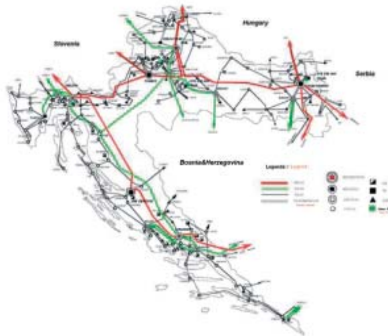
Slika 4 Planirana konfiguracija prijenosne mreže RH 2010. godine (PSS/E model za 2010. i 2015. godinu) Figure 4 Planned configuration of the transmission network of the Republic of Croatia in 2010 (PSS/E model for 2010 and 2015)

Following the calculation of power flows, under each scenario system loads are iteratively corrected to also accommodate the network losses which the GTMax model does not take into account. Consequently, the analysed system loads in the GTMax model correspond with the sum of loads and losses in each system within the PSS/E regional model. Regarding the balance of each system within the GTMax model deriving from the market engagement of power plants and the modelled load of each system, the same was corrected in the PSS/E model according to the geographic position of each power plant (e.g. in the GTMax model half the capacity of the Krško power plant is included in the balance of Croatia, and in the PSS/E model it is excluded from the balance; the output of generator 2 of the Dubrovnik hydroelectric power plant is included in the balance of Bosnia-Herzegovina in the GTMax model, whereas in the PSS/E model it is included in the balance of Croatia).