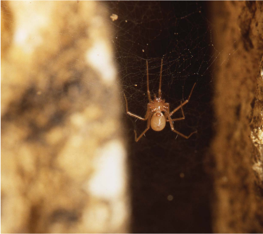
Fig. 2. Troglohyphantes subalpinus (♀) in its typical habitat in the locality Židovske jame.

The subgenus Troglohyphantes is the most widespread subgenus. It is distributed throughout Europe: Cantabria, Pyrenees, Carpathians, Rhodopes, Alps, Apennines and Dinarides (DEELEMEN-REINHOLD, 1978). According to DEELEMEN-REINHOLD (1978) it is divided into 3 series and 12 groups. Series A consists of three groups: furcifer , herculanus and cerberus , series B of five groups: henroti , marqueti , roberti , polyophthalmus and diurnus and series C of four groups: noricus , salax , orpheus and croaticus . Species in our research belong to series B and C.