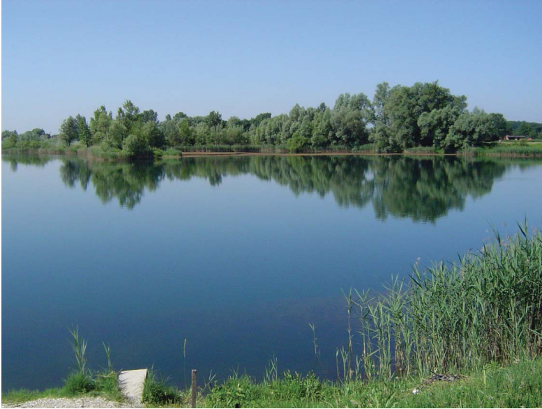
Fig. 1. Čingi-Lingi Lake.

Specimens were collected in the 16 m deep part of the lake by means of vertical hauls using plankton net with a mesh size of 67 \mu\text{m} . Samples were preserved in 4% formaldehyde. For the purpose of determination, animals were dissected in glycerol and analysed under an Olympus microscope. Copepod determination was carried out according to EINSLE (1993, 1996) and KIEFER (1978), while cladoceran determination was carried out according to AMOROS (1984), MARGARITORIA (1983) and KOROVCHINSKY (1992).