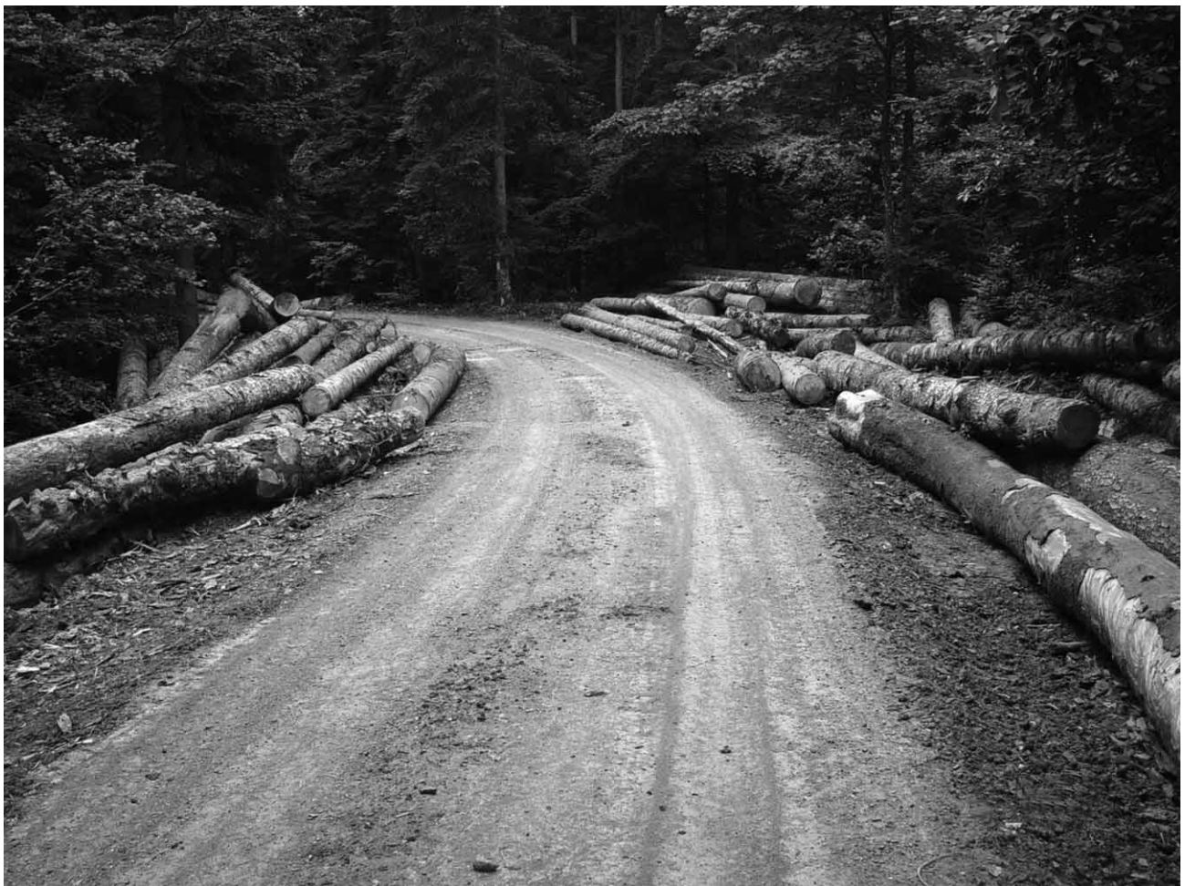
Fig. 1 Research site Litorić - Salvage cut

Slika 1. Lokacija istraživanja Litorić - sanitarna sječa