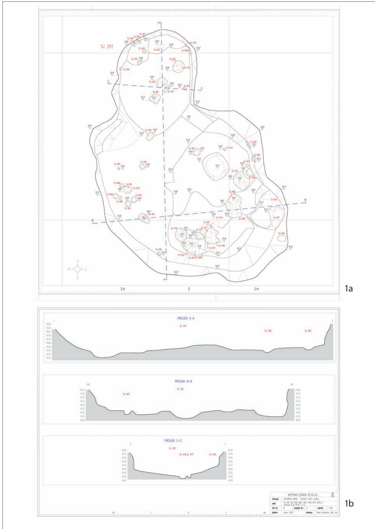
Sl. 1 a) Tlocrt radne zemunice 291 na Galovu u Slavonskom Brodu (izradila: N. Kovačević, Arheo plan d.o.o.), b) Presjeci radne zemunice 291 na Galovu u Slavonskom Brodu (izradila: N. Kovačević, Arheo plan d.o.o.) Fig. 1 a) Ground plan of working pit 291 at Galovo in Slavonki Brod (made by N. Kovačević, Arheo plan d.o.o.), b) Cross-sections of working pit 291 at Galovo in Slavonki Brod (made by N. Kovačević, Arheo plan d.o.o.)