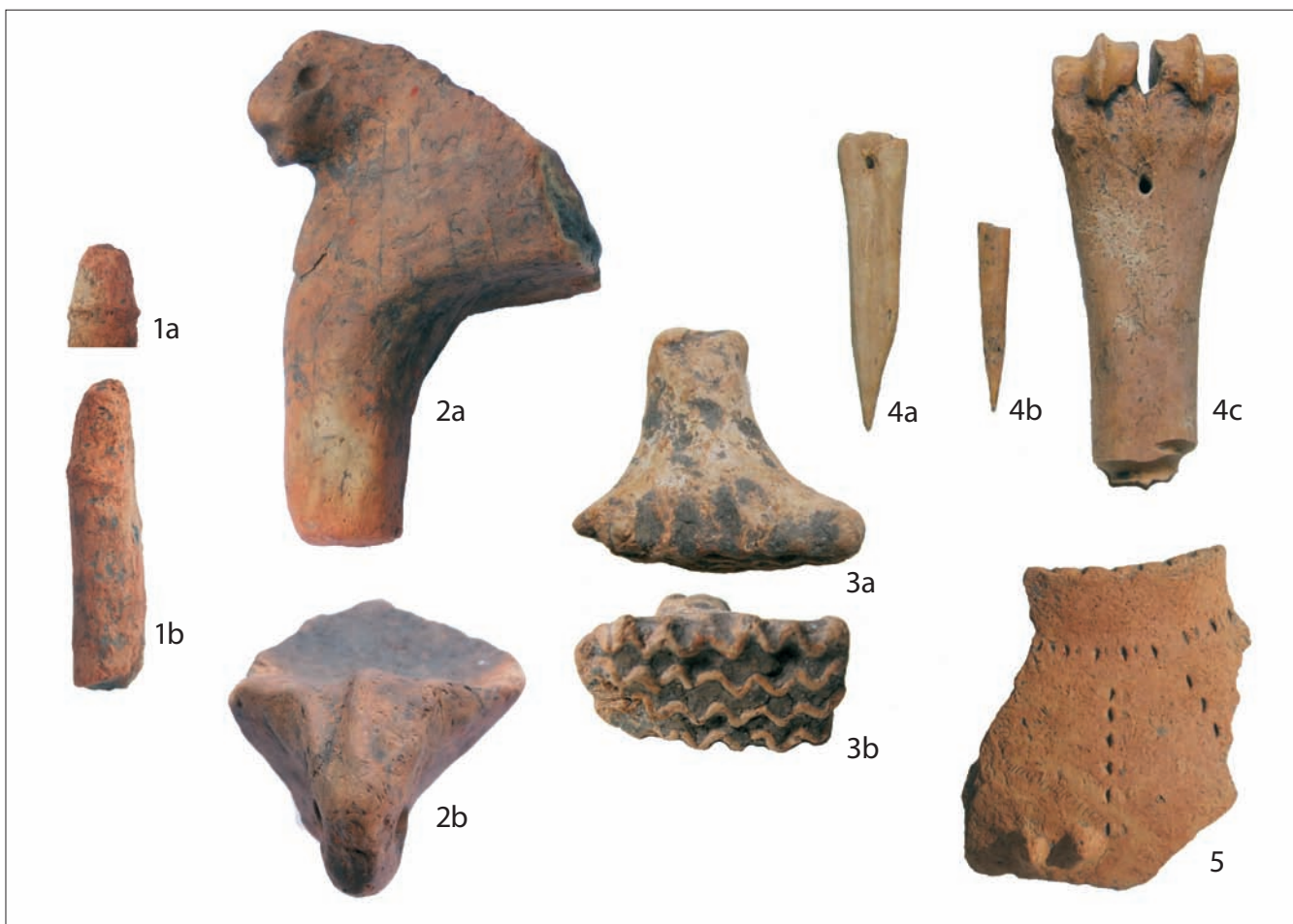
Sl. 5 Radna zemunica 291: 1a i b antropomorfna protoma na žrtveniku; 2a i b noga žrtvenika s protomom ovna i urezanim znakovima; 3a i b pintadera; 4a,b,c koštana šila – igle; 5 ulomak lonca s urezanim ukrasnim šavovima na trbuhu (snimila: K. Minichreiter)