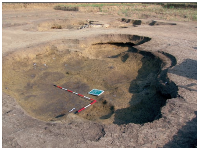
Sl. 2 Slavonki Brod, Galovo, radna zemunica 291