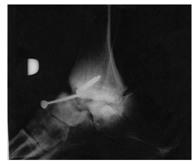
Fig. 2. Lateral radiographs of the ankle 26 months after first operation showed failed arthrodesis.

Ten months after the second operation, roentgenograms showed bone consolidation in the region of arthrodesis (Figure 3). The patient was without symptoms, unrestricted in any daily work. The patient achieved good results ten months after the reoperation.