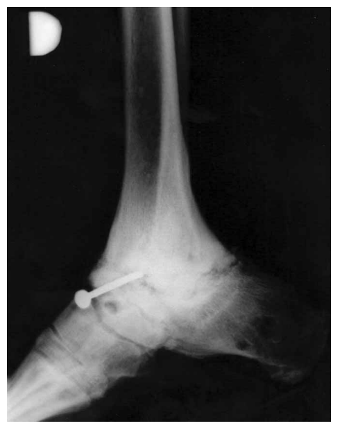
Fig. 3. Lateral radiographs of the ankle 10 months after second operation showed bone consolidation in the arthrodesis region.

Total dislocation of the talus (i.e. tibiotalar, talonavicular and talocalcaneal disruption) is an uncommon injury and has been reported in approximately 0.06% of all dislocations and 2% of all talar injuries<sup>3,4</sup>. It is an extremely rare injury because of its deep position in the foot, the strong ligamentous support and the amount of force required for its dislocation<sup>5,6</sup>. Total talar dislocation is usually an open injury<sup>5</sup>. The talus is predisposed to dislocation because of its anatomical characteristic: it is the only bone in the lower extremity without muscle attach-