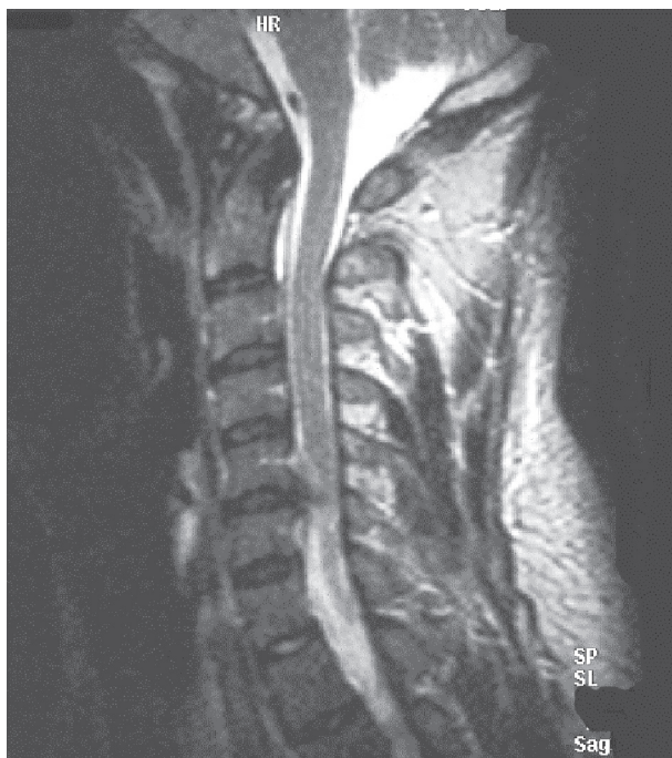
Fig. 1. Magnetic resonance image of the spine-dorsal protrusion at C4-C5 level, with compression of the frontal arachnoid area and spinal medulla, and slight reduction of the frontal arachnoid area at C5-C6 level.

A 43-year-old woman reported pressure and subsequent pain experienced for the last two years with growing intensity in the neck and along both arms, more pronounced on the left side. Rough motor strength of the