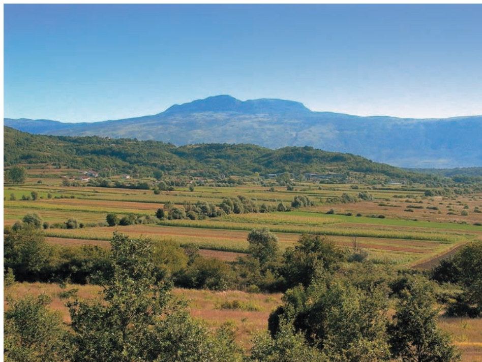
Figure 1 View over Polje Čepić and Učka Mountain from the site discovered at Ivšićće.

ies carried out so far have been focusing on the finding and excavation of cave sites. This research bias had an important impact on generalised interpretations of the prehistoric land use and occupation strategies in the east Adriatic (Inga 2003). The systematic survey of Polje Čepić in 2004 and 2005 implemented our knowledge of the regional prehistory with the discovery of over a dozen previously unknown open-air sites, with artefacts characteristic of the Upper Palaeolithic, Mesolithic and Neolithic periods (Figure 1 and 2).