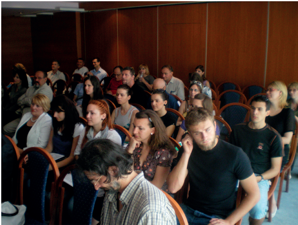
Studenti Sveučilišta u Zadru, sudionici XVI međunarodnog znanstvenog skupa „Društvo i tehnologija“ / Students from Zadar University, Participants of XVI international scientific conference „Science and Technology 2009“