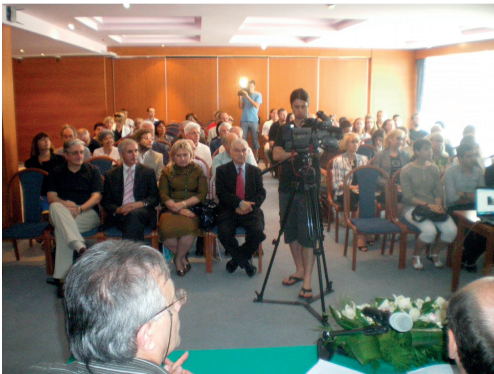
Sudionici XVI međunarodnog znanstvenog skupa „Društvo i tehnologija 2009“ Participants of XVI international scientific conference „Science and Technology 2009“