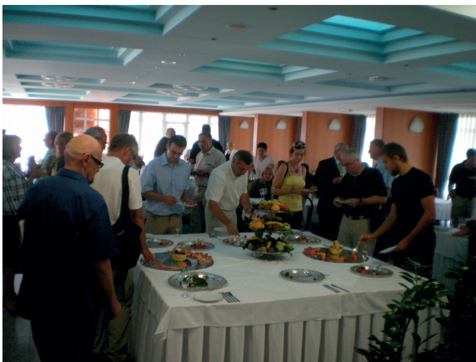
Domjenak za sudionike skupa pod pokroviteljstvom Visoke škole „Baltazar Adam Krčelić“ Coctail party for the conference participants sponsored by College of Businee and Management „Baltazar Adam Krčelić“