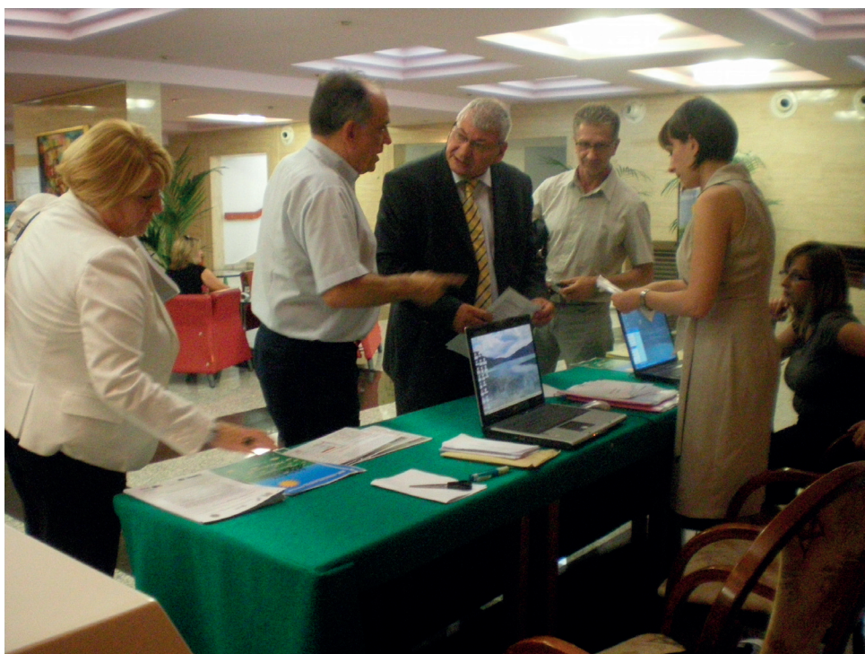
Organizacijski odbor XVI međunarodnog znanstvenog skupa „Društvo i tehnologija 2009“ Organizing Committee of XVI international scientific conference „Science and Technology 2009“