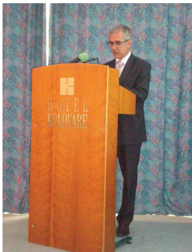
Stipe Zrilić župan Zadarske županije / Prefect of Zadar County Svečano otvaranje i pozdravni govor / Opening of the Conference and welcoming speech