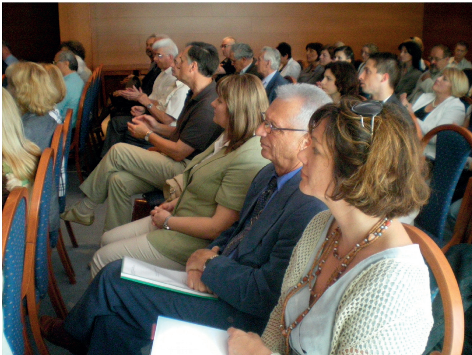
Sudionici XVI međunarodnog znanstvenog skupa „Društvo i tehnologija 2009“ Participants of XVI international scientific conference „Science and Technology 2009“