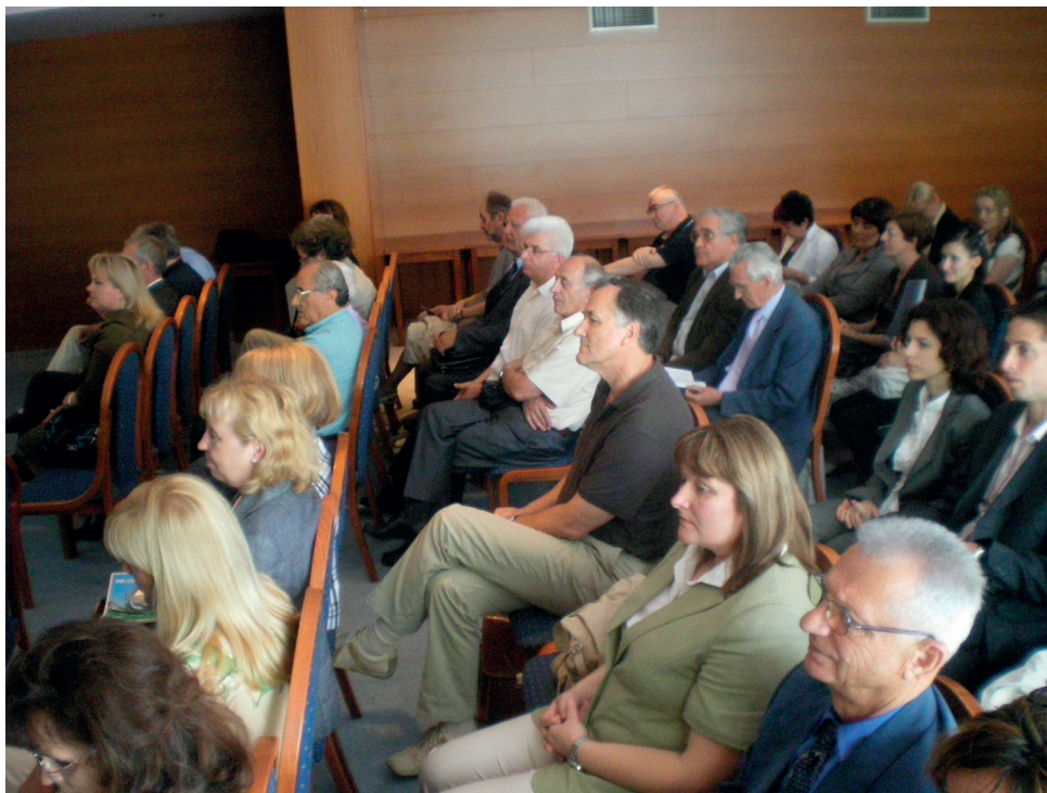
Sudionici XVI međunarodnog znanstvenog skupa „Društvo i tehnologija 2009“ Participants of XVI international scientific conference „Science and Technology 2009“