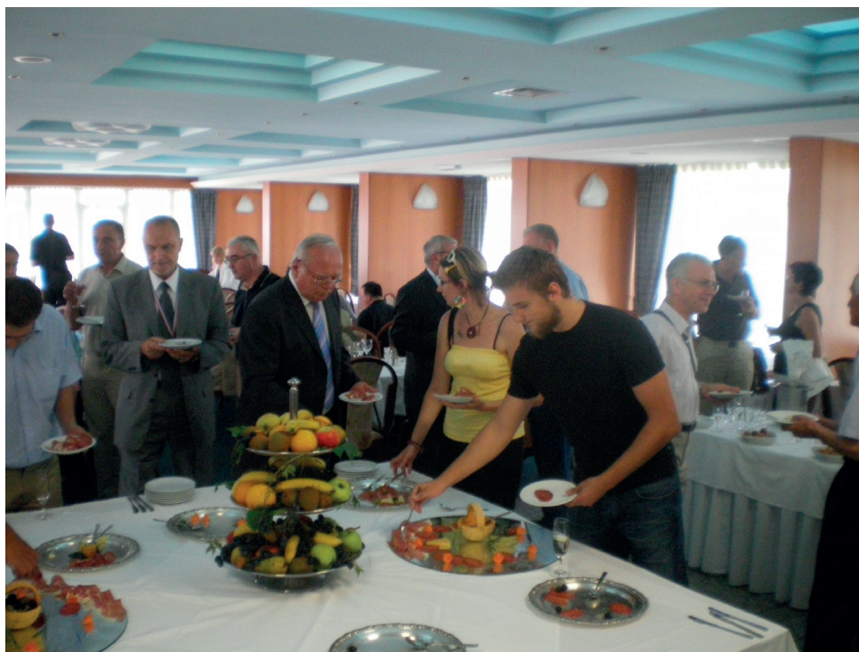
Domjenak za sudionike skupa pod pokroviteljstvom Visoke škole „Baltazar Adam Krčelić“ Coctail party for the conference participants sponsored by College of Businee and Management „Baltazar Adam Krčelić“