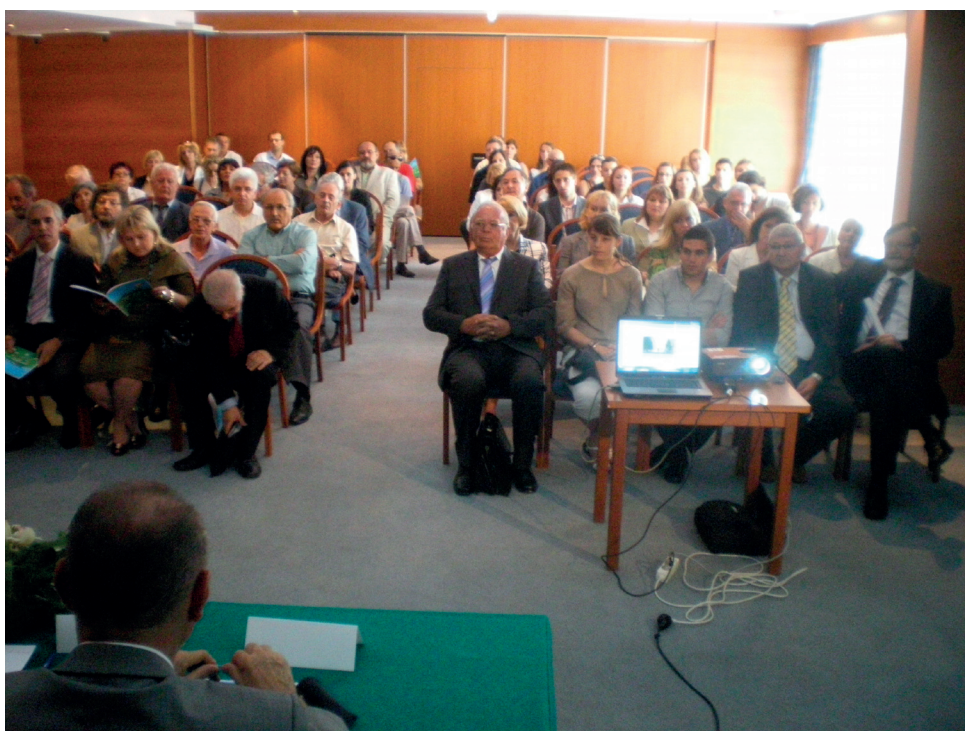
Sudionici XVI međunarodnog znanstvenog skupa „Društvo i tehnologija 2009“ Participants of XVI international scientific conference „Science and Technology 2009“