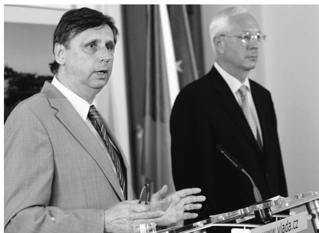
Premier Jan Fischer and President of the ASCR Professor Jiří Drahoš (right)

evaluate fruitfulness of research. Such common problems have to progress quickly because future budgets for the Academy will depend on evaluation procedures, as the Finance Minister said. However, the Academy has been applying its internal evaluation procedures for more than five years by means of international evaluation committees.