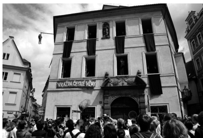
Demonstration of execution the Czech science – VRAŽDA ČESKÉ VĚDY (=MURDER OF CZECH SCIENCE)

Moreover, common consent was found in organizing a round table discussion before end of August 2009 on how to measure and