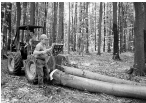
Figure 1 Cutter and tractor driver's work related to load hooking

task of the work team is to achieve better connection and performance of all operations, starting with the preparation work and ending with the delivery of the forest assortments to the buyer. The basic characteristics of teamwork is a single work order determined on the basis of individual daily standard efficiencies of each member of the team. The daily standard efficiency is calculated and showed averagely per member of the team. The workers carry out the work at the same workplace with the same means and object of work (Fig. 1).