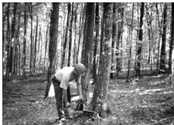
Figure 2 Cutter engaged in felling and processing

The effective time of the tractor E per unit is 21.64 min/m 3 , and of the tractor T 20.67 min/m 3 , which is by 4.5 % lower than the tractor E. Total time consumption per unit of the tractor E is 42.05 min/m 3 , and of the tractor T 35.04 minutes and hence by 7.01 min/m 3 lower. The average daily efficiency of the tractor E is 9.98 m 3 /day, and of the tractor T it is 11.43 m 3 /day. The tractor T skidded on average 1.45 m 3 /day more than the tractor E, which is by 12.7 % more.