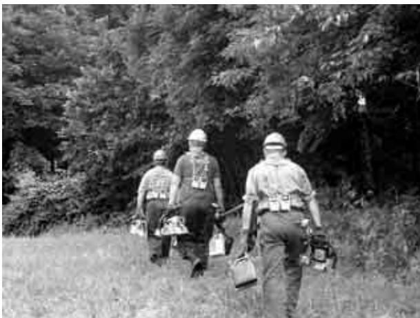
Figure 3 Cutter going to the felling site with driving device on its back Slika 3. Odlazak sječača u sječinu s pogonskim uređajem na leđima

The research was carried out in the mountainous part of Croatia (Litorić, Gorski Kotar) as shown in Figure 2 at an altitude of 750 m. The compartment is of an area of 22.77 ha with 70 % coverage. This stand is made of fir and beech with a total growing stock of 306 m 3 /ha of which fir accounts for 48.4 %, beech for 39.1 % and other hard-wood broadleaved species for 12.5 %. In the compartment 465 trees were marked for felling with a mean volume of 1.71 m 3 , and the mean volume of fir was 1.81 m 3 .