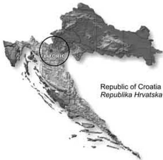
Figure 2 Site of research Slika 2. Prikaz mjesta istraživanja