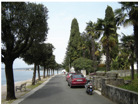
Slika 3. Između uvala Portić i Draga – jedna od najstarijih zona vikendaštva u Malinskoj

Figure 3 Between the inlets of Portić and Draga – one of the oldest second home zones in Malinska (Photo: VUK TVRTKO OPAČIĆ, 30 th March 2007)