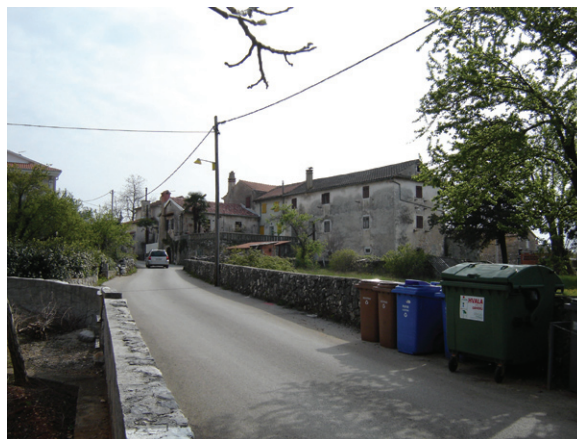
Slika 4. Jedne od posljednjih preostalih starih kuća u Milčetićima, danas dijelu Malinske

Figure 3 Between the inlets of Portić and Draga – one of the oldest second home zones in Malinska (Photo: VUK TVRTKO OPAČIĆ, 30 th March 2007)