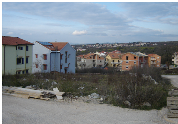
Slika 7. Gotovo se svakodnevno proširujući, zona apartmana danas pomiče granice prostornih gabarita Malinske; u pozadini: nekada odvojeno, a danas, zbog snažne vikendaške izgradnje, gotovo s Malinskom sraslo naselje Sveti Vid Miholjice

Figure 6 Apartment interpolations in the very centre of Malinska considerably increase the urbanisation of space