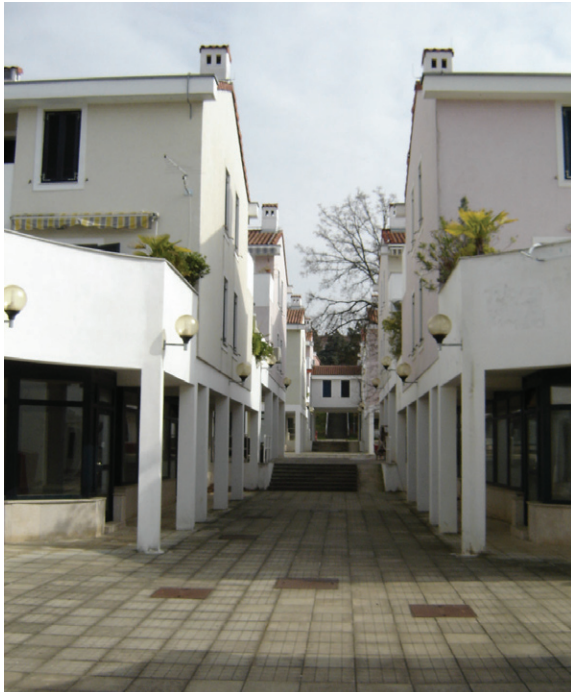
Slika 8. Neuseljeni i zatvoreni poslovni prostori pojačavaju atmosferu "grada duhova" u apartmanskom naselju Dub izvan sezone

Figure 8 Unoccupied and closed commercial premises increase the atmosphere of a "ghost town" in the apartment resort Dub out of season