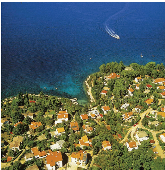
Slika 10. Vantačići – primjer otežana pristupa morskoj obali, javnom dobru, zbog guste vikendaške (apartmanske) izgradnje

Figure 10 Vantačići – an example of difficult access to the shore, a common good, resulting from thickly built second homes (multi-apartment buildings)