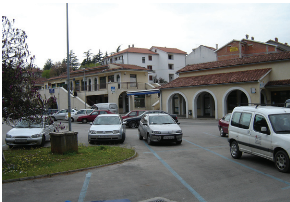
Slika 6. Apartmanske interpolacije u samom središtu Malinske znatno povećavaju izgrađenost prostora

Figure 6 Apartment interpolations in the very centre of Malinska considerably increase the urbanisation of space