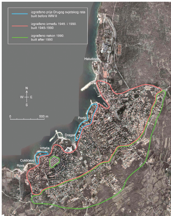
Slika 2. Faze razvoja vikendaštva u Malinskoj 16