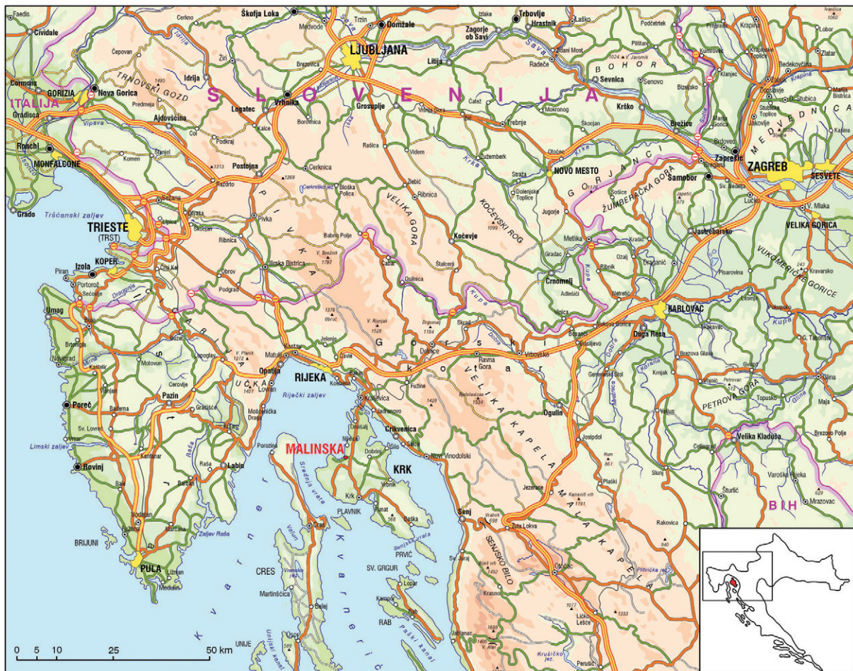
Slika 1. Geografski položaj Malinske Figure 1 Geographical position of Malinska

u 20. stoljeće i između dva svjetska rata) stanovit broj mještana iselio se u SAD (najviše New York), dok je emigracijska struja prema Južnoj Americi, Zapadnoj Europi i Australiji bila nešto slabije izražena. Stanovništvo Malinske kroz prošlost višekratno je proživljavalo socioekonomsku preobrazbu. U početku su se mještani uglavnom bavili poljoprivredom, ribarstvom i pomorstvom, potom trgovinom, brodarstvom i obrtom, te naposljetku turizmom i ugostiteljstvom. U najnovije vrijeme vikendaštvo se sve više afirmira i kao unosna grana gospodarstva, koja neposredno i posredno utječe na povećanje zaposlenosti u Malinskoj.