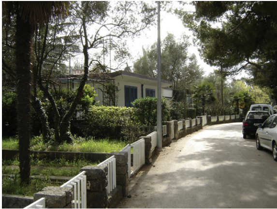
Slika 5. Vikendaška četvrt obiteljskih kuća za odmor i rekreaciju okruženih vrtovima u blizini hotela Malin

Figure 5 A second home district of family houses for vacation and recreation surrounded by gardens in the vicinity of hotel Malin (Photo: VUK TVRTKO OPAČIĆ, 30 th March 2007)