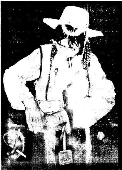
Photo 6: A young Tibetan boy on his way around Kailas in traditional clothing.

(called Gogra in the plains), is called “Magcha Khambab” (Mag.byā Kha-hbab) — flows out of peacock’s mouth . These animals are symbols of the four Dhyāni Buddhas and the names of the rivers show that they are considered to be parts of the universal maṇḍala with Kailas as its center (Govinda 1984:199-200).