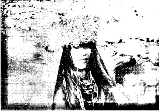
Photo 5: Tibetan woman carrying a child on the way around Kailas, wearing traditional clothing. Photo by: T. Vinšćak, 1999.