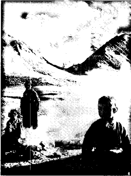
Photo 1: The northern side of Kailas. Resting pilgrims.