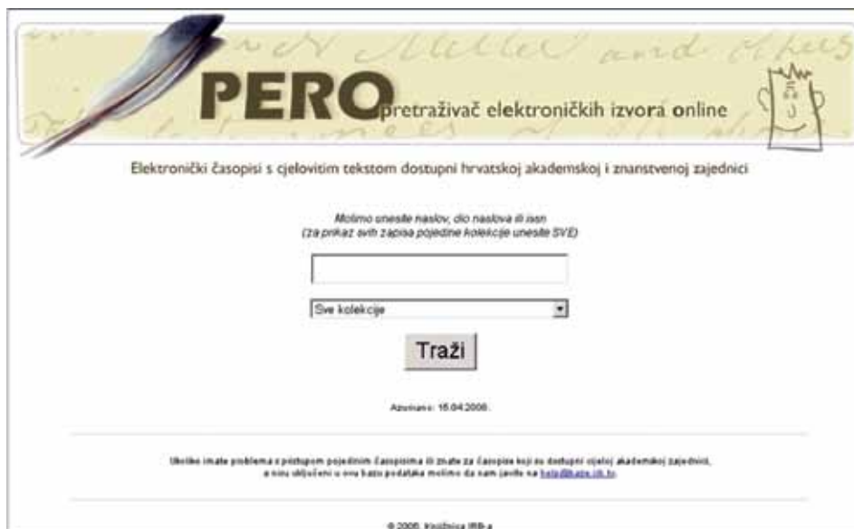
Fig. 5. PERO – browsing screen