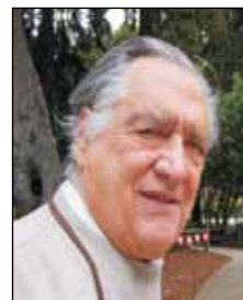
W. R. Tobler